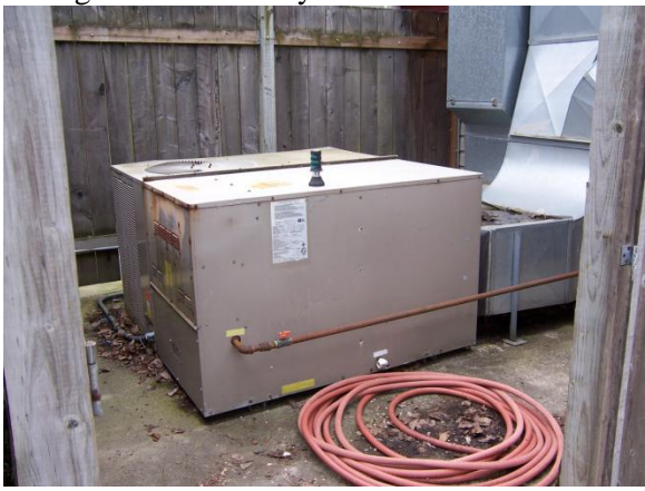
Goodman Gas-Pack provides heating & cooling.

1. Repair/replace/re-synchronize the heating, cooling and hot water systems.