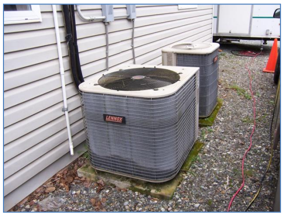
Lennox split system AC provides and heating via air handlers in attic with hot water coil heat.

2. Assign a SO staff person as ongoing SAR Facility Manager to be responsible for the ongoing performance of this facility to save money on monthly utility bills.