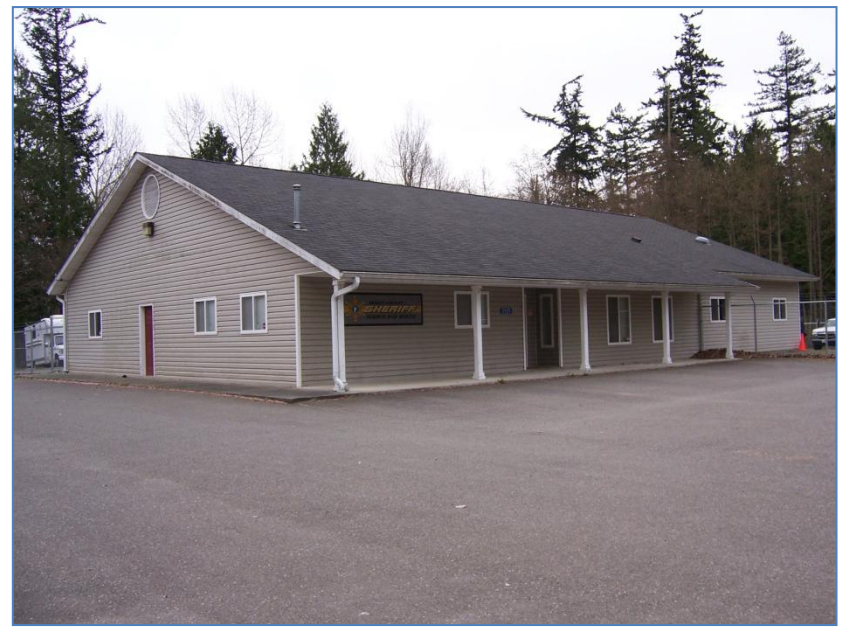
Skagit County Sheriff's Office Search and Rescue (SAR) Building

Key Findings based on the Resource Conservation Audit in priority: