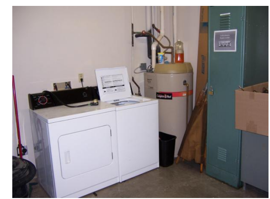
Lennox 'Complete Heat' hot water system is not working.

The systems are not working as intended nor synchronized well with the thermostats. They may need to be replaced. This will not be cheap to fix, but can be done with no cash outlay with an Energy Saving Performance Contract through the State General Administration Office. The County has agreed to work with McKinstry, first for a 'performance grade' audit of several facilities, and then to implement agreed upon projects. The contractor will be paid by a State loan to the County and the loan is paid back from monthly savings on utility costs, primarily energy.