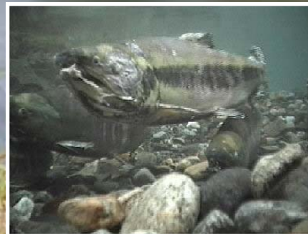
Chum Salmon

Skagit County could provide up to $35,000 in free funding and assistance to complete a project that enhances the stream on your property.