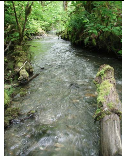
Tributary to the Sauk River

Free grant funds to help you improve the streams of Skagit County