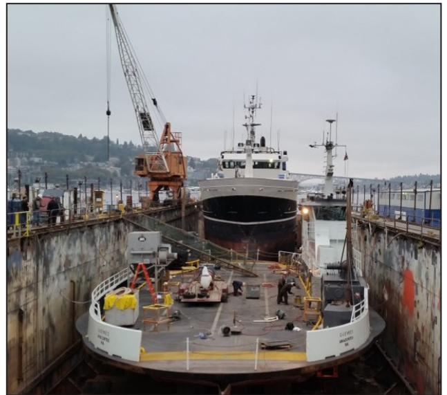
The last haul-out for the M/V Guemes, seen above at Foss Shipyards in Seattle, was February and March of 2019.

Want to receive haul-out updates? Sign up for Guemes Island Ferry emails: skagitcounty.net/Departments/Home/emailListmain.htm .