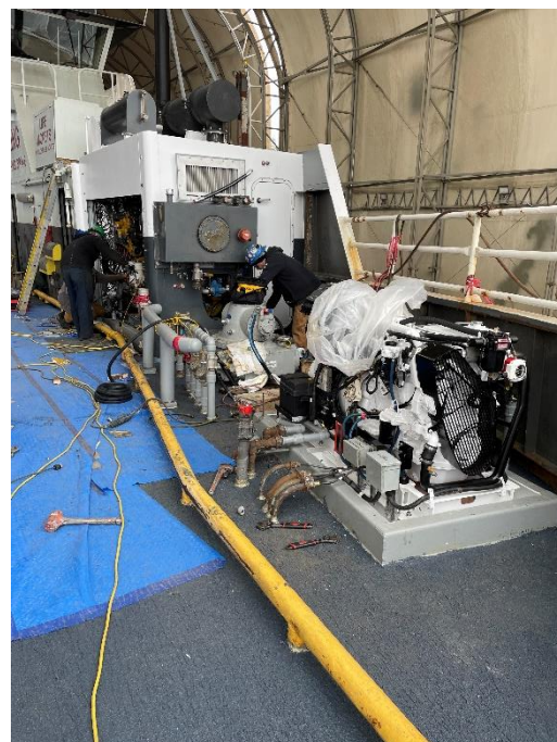
Hooking up Engine No. 2. systems