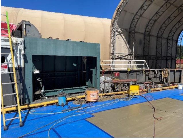
Engine enclosure with first coat of primer

We will continue to send out updates on drydock work to the email listserv and social media channels. If you have any questions, please contact the ferry office at ferrycomments@co.skagit.wa.us or 360-293-6433. More information on the ferry can be found on our website: www.skagitcounty.net/ferry