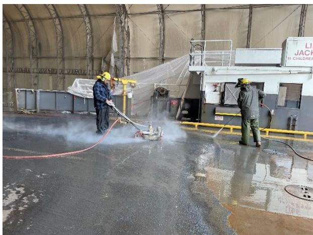
Stripping paint off the car deck.

Skagit County's Ferry Division has continued to request an updated schedule for completion of the drydock work from Nichol's Brothers Boat Builders (NBBB), but we still do not have a firm return to service date. The most recent update from NBBB estimates the drydock work would be completed on May 15 th , with dock and sea trials from May 16 th – May 18 th , and then the ferry would sail back to Anacortes on May 19 th . We would then need an additional three business days to complete the incline test for the U.S. Coast Guard (USCG) stability letter. Only after issuance of the new stability letter can the vessel re-enter regular service. Following this schedule, the soonest the vessel could be back on a normal sailing schedule would be May 22 nd .