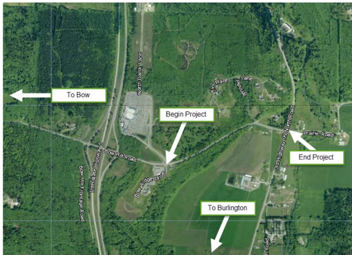
Project Vicinity Map