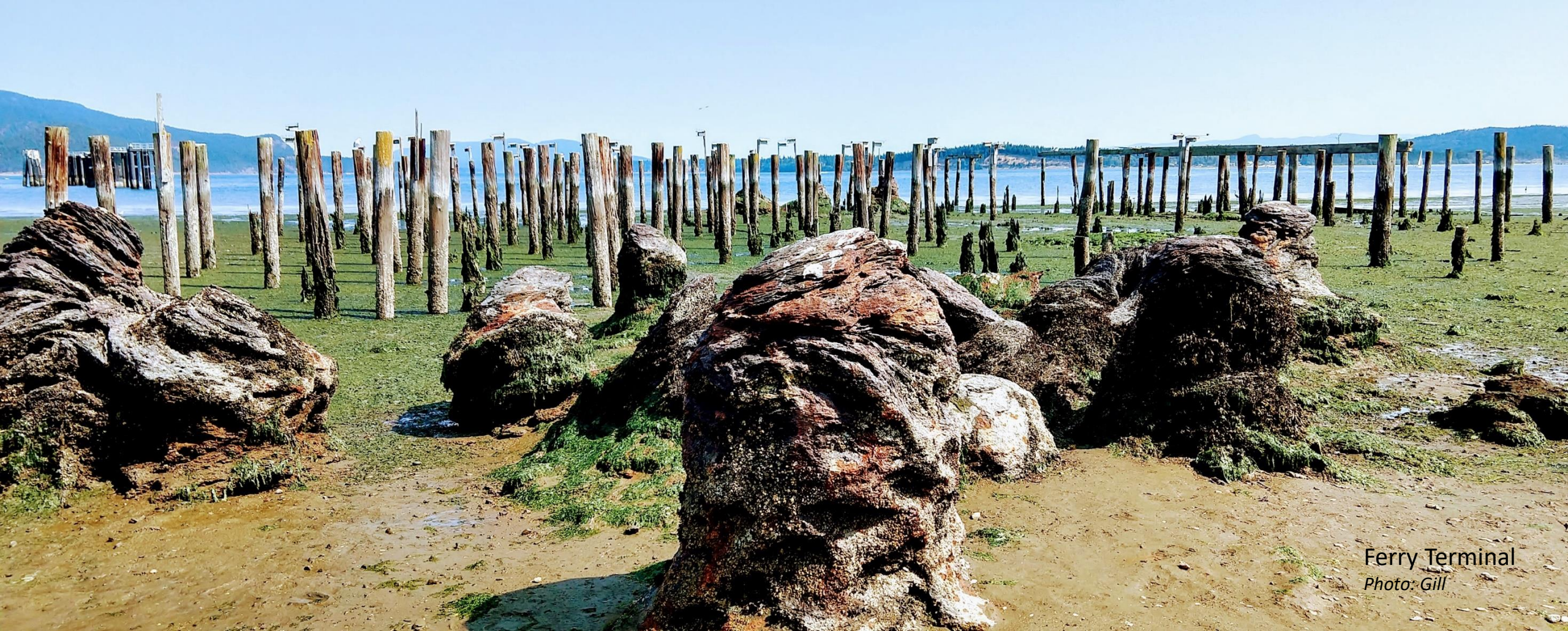
Ferry Terminal