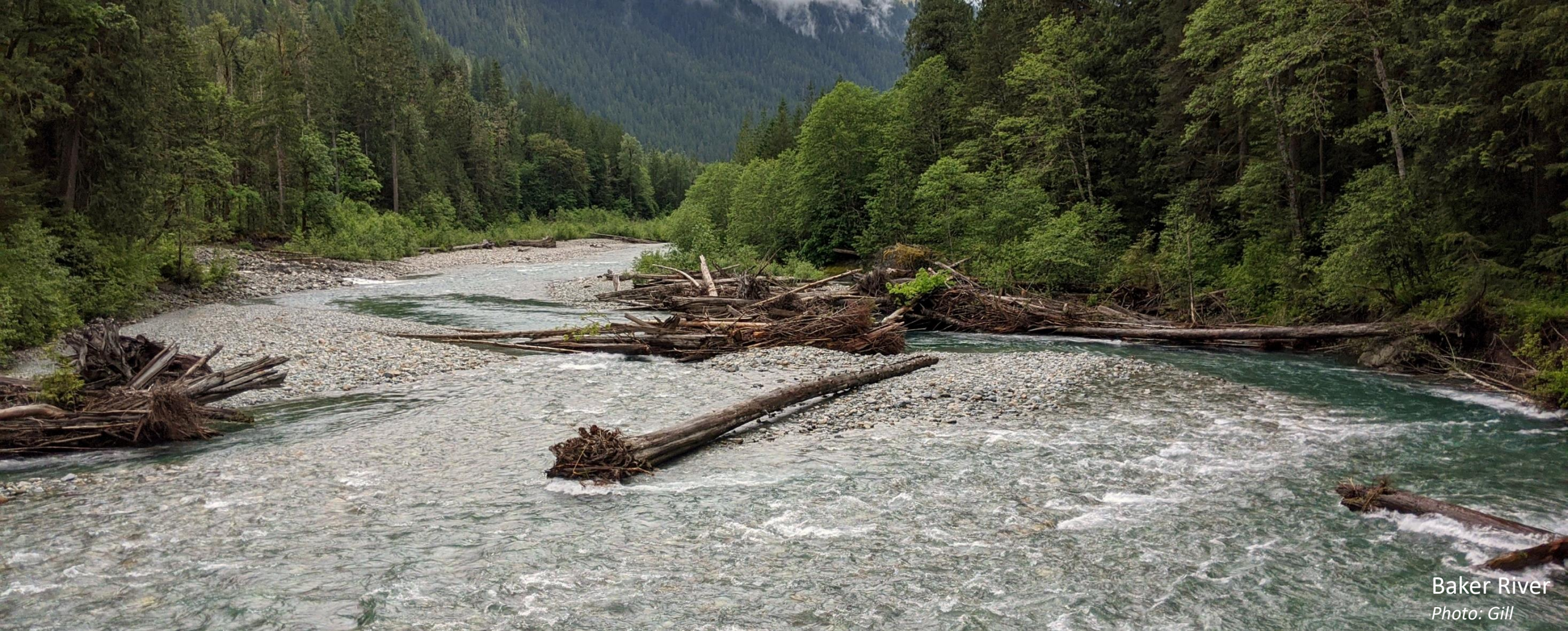
Baker River