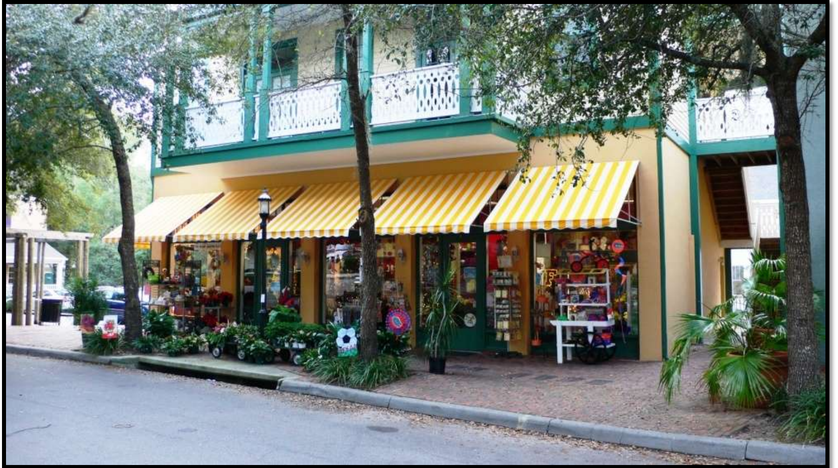
Village Center – Haile Plantation, FL