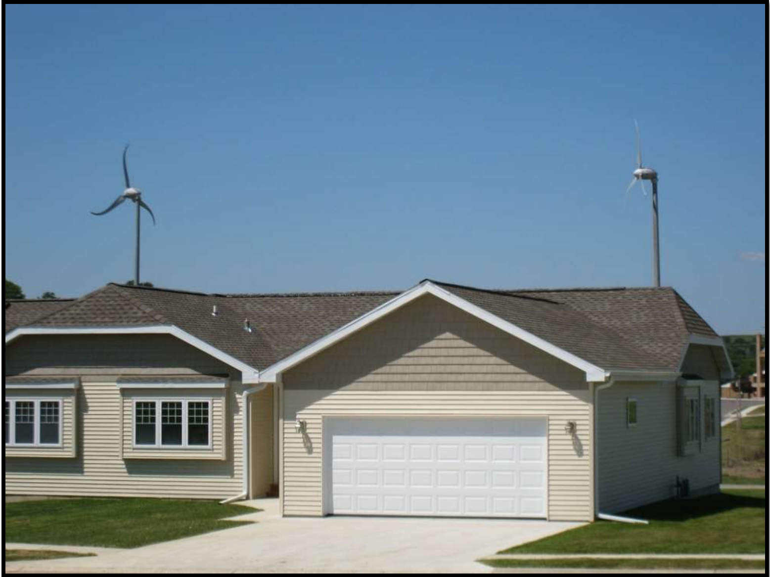
Residential Wind Power – Winnebago, NE