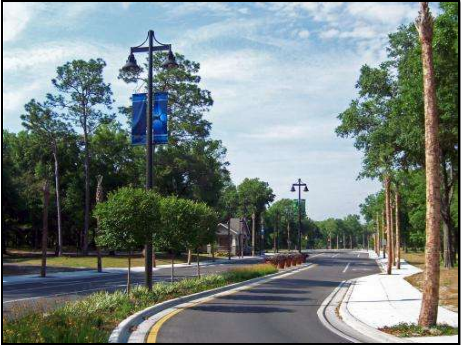
Streetscape – Gainesville, FL