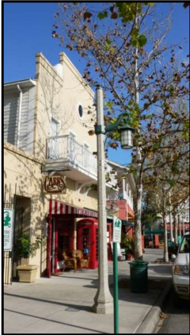
Commercial Storefront – Celebration, FL