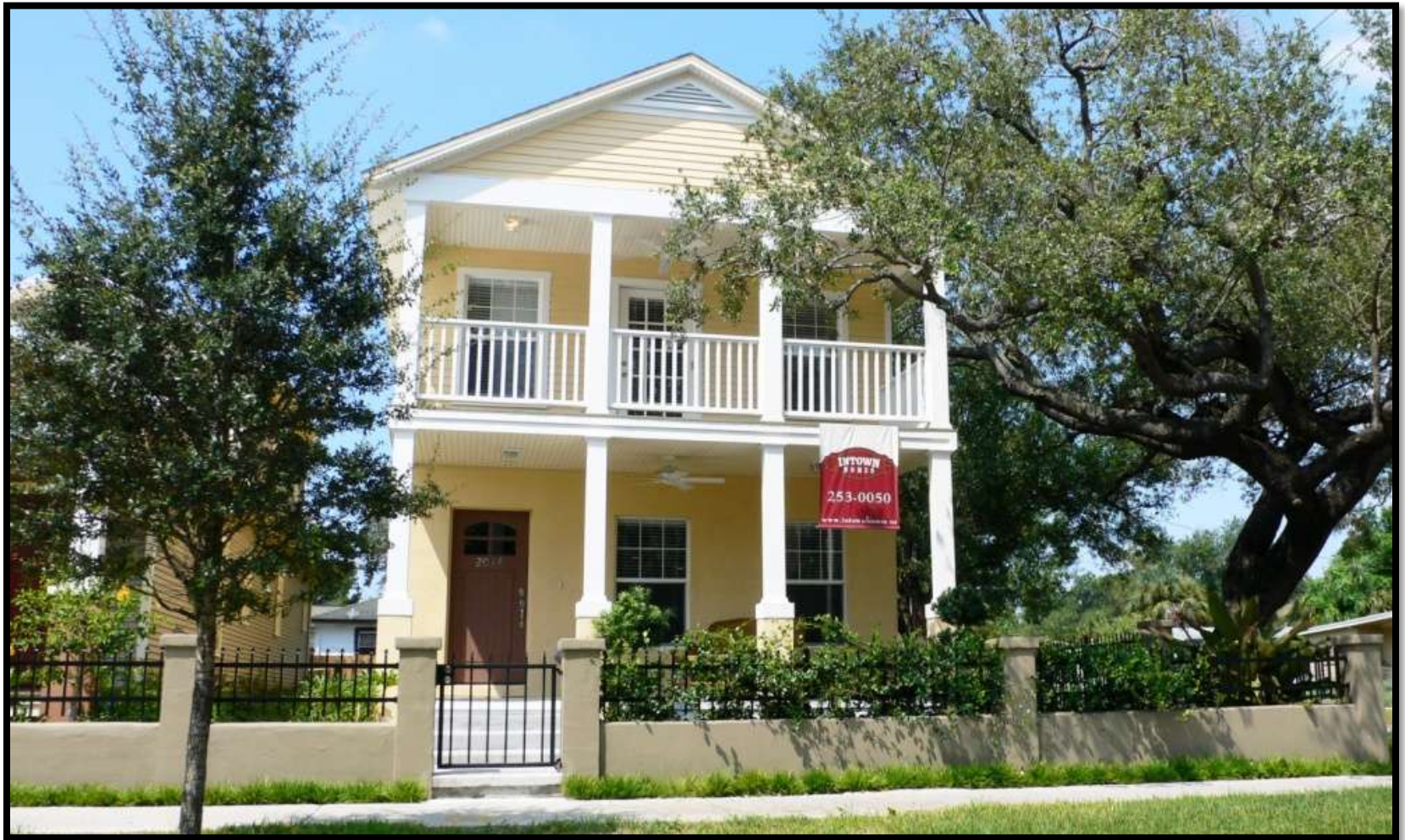
Residential – Tampa, FL