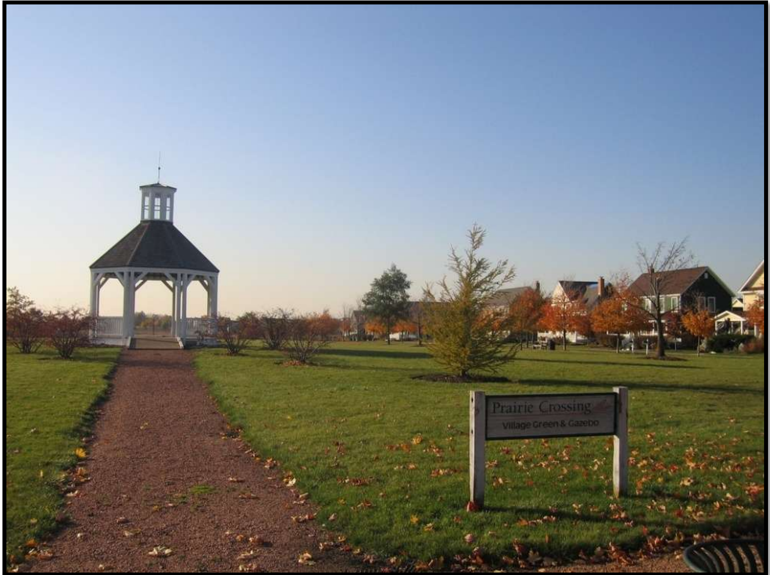
Open Space Village Green - Greys Lake, IL