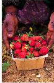
a view from community agricultural fields that back up to the new rural village.