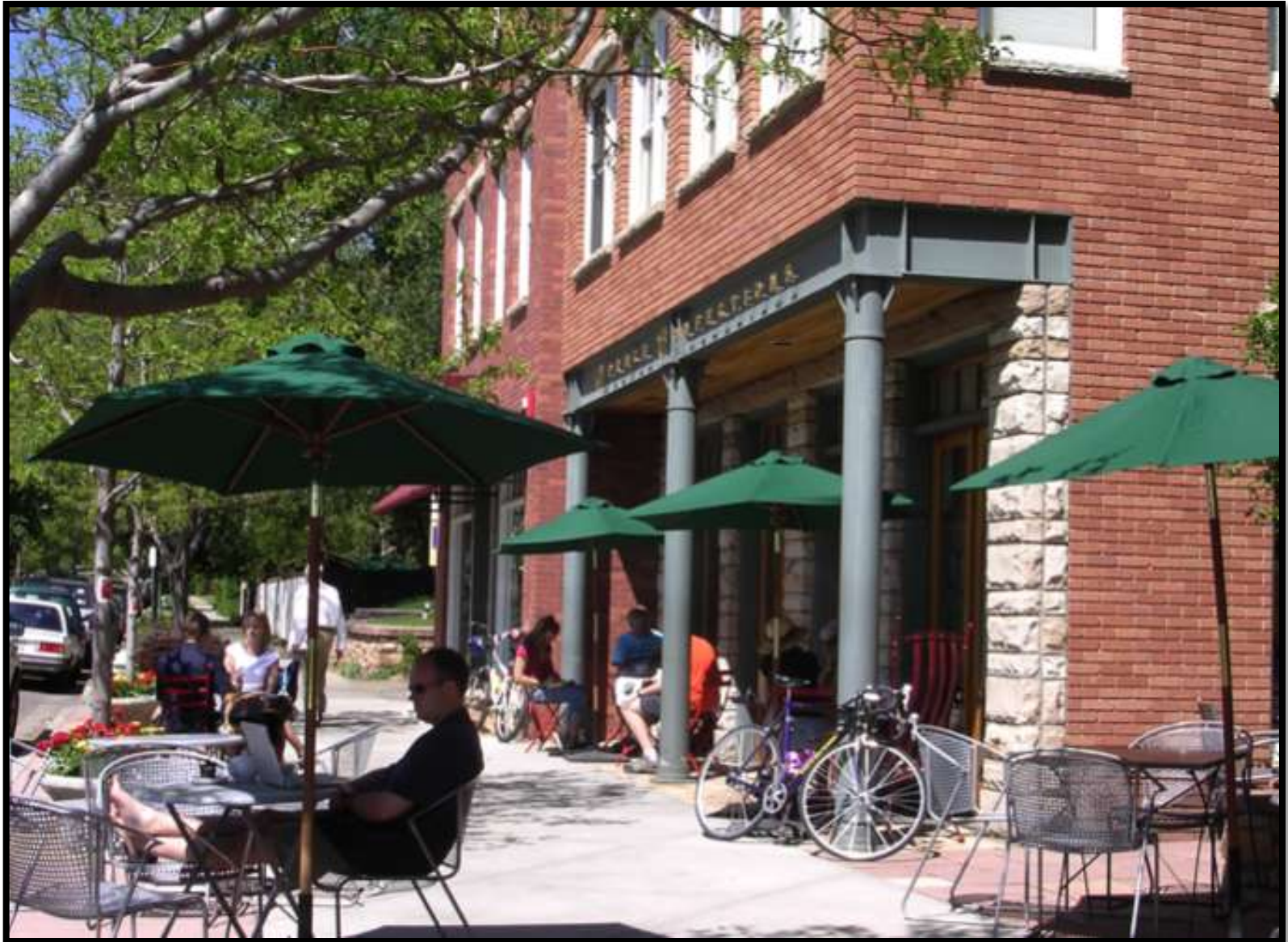
Mixed Use – Boulder, CO