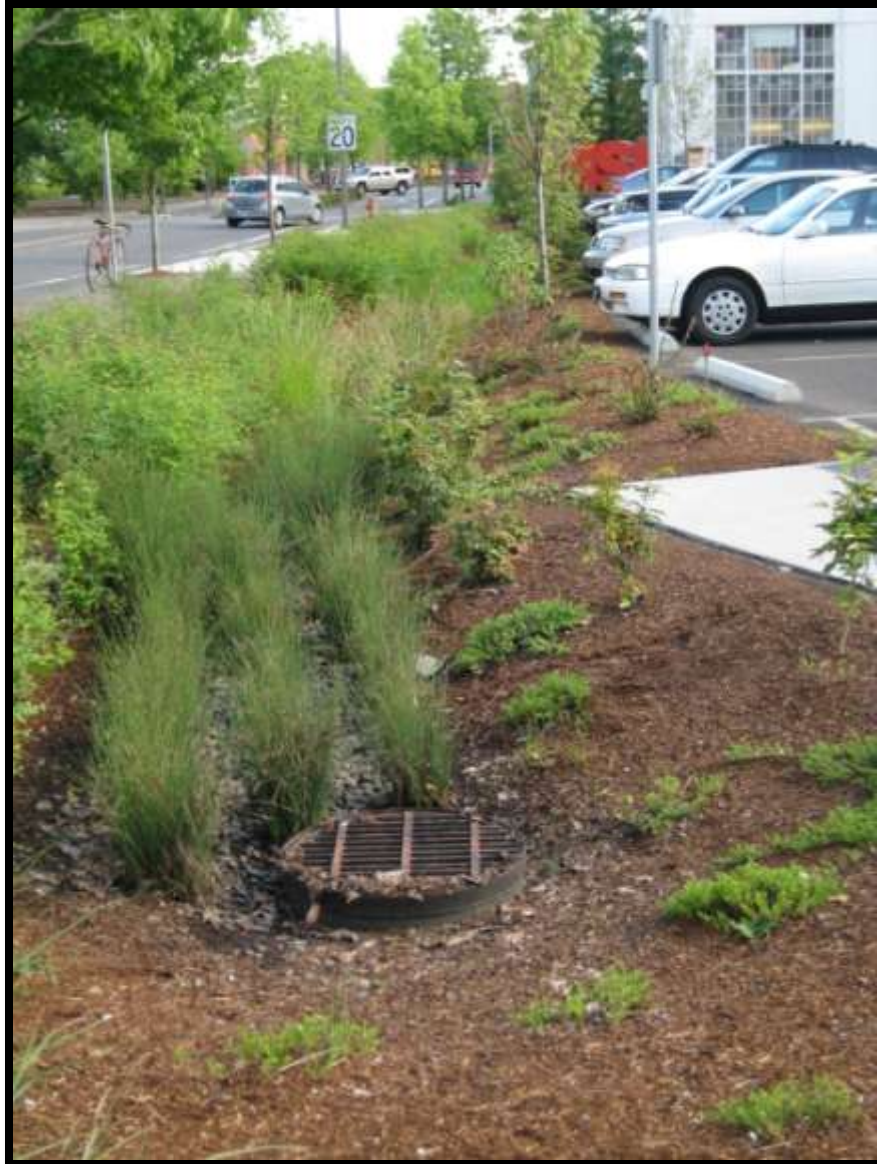
Low Impact Development