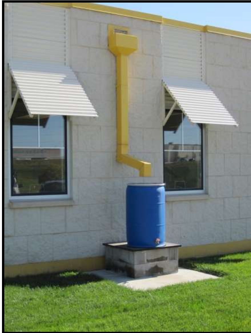
Low Impact Development – Omaha, NE