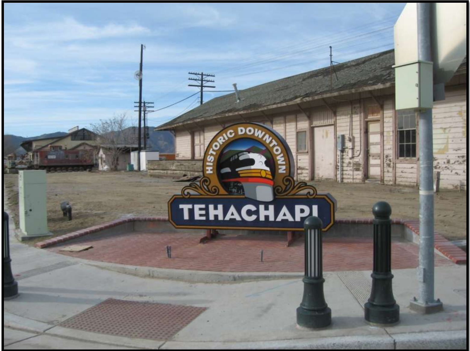
Gateway – Tehachapi, CA