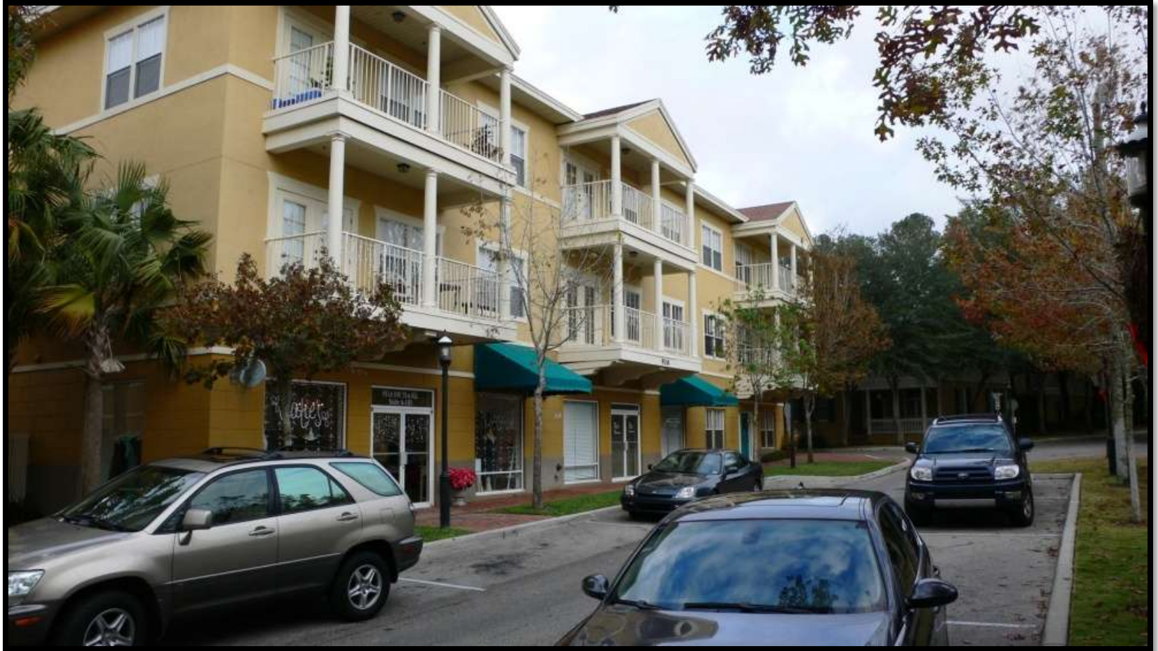
Mixed Use – Haile Plantation, FL