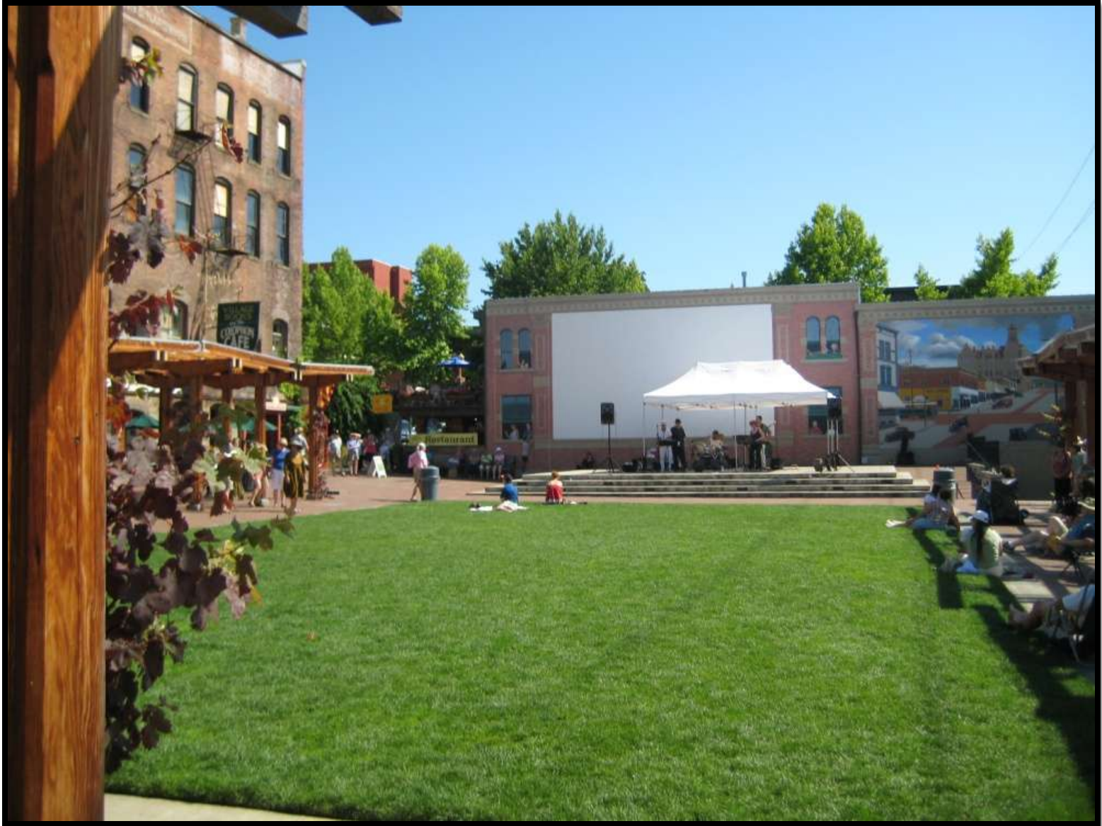
Open Space – Bellingham, WA