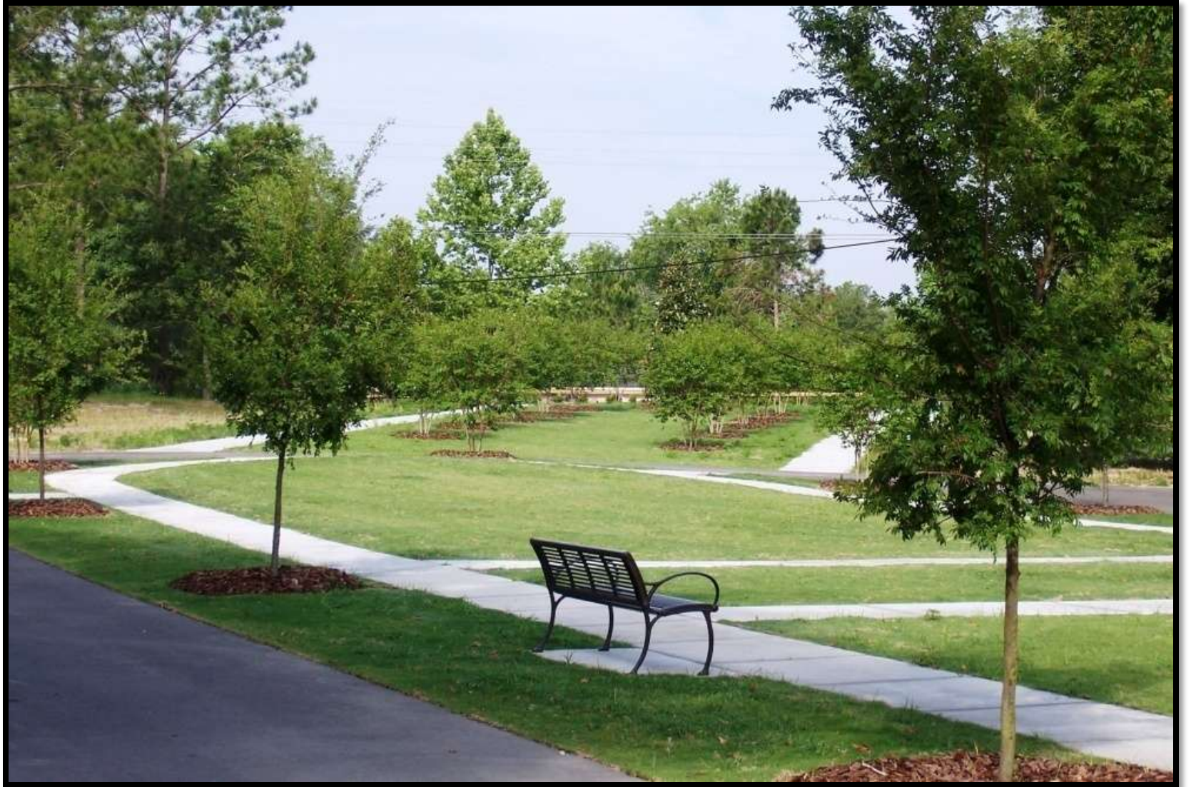
Passive Green Space – Gainesville, FL