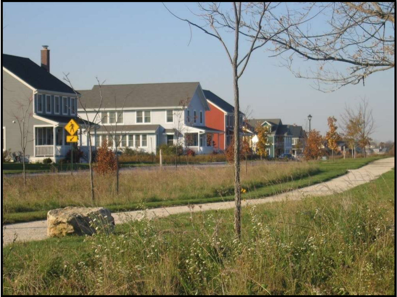
Residential Trail – Greys Lake, IL