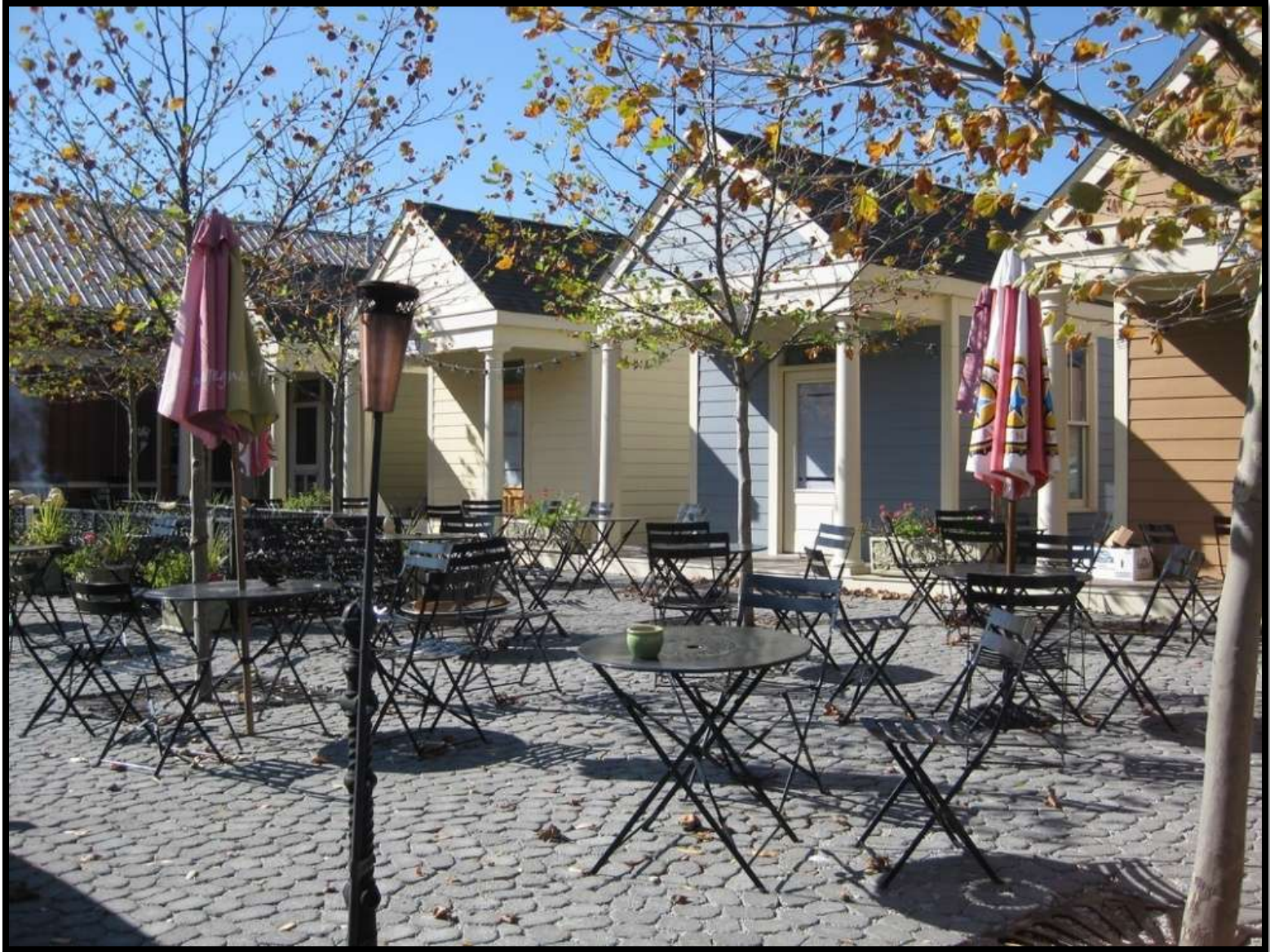
Public Square – St Charles, MO