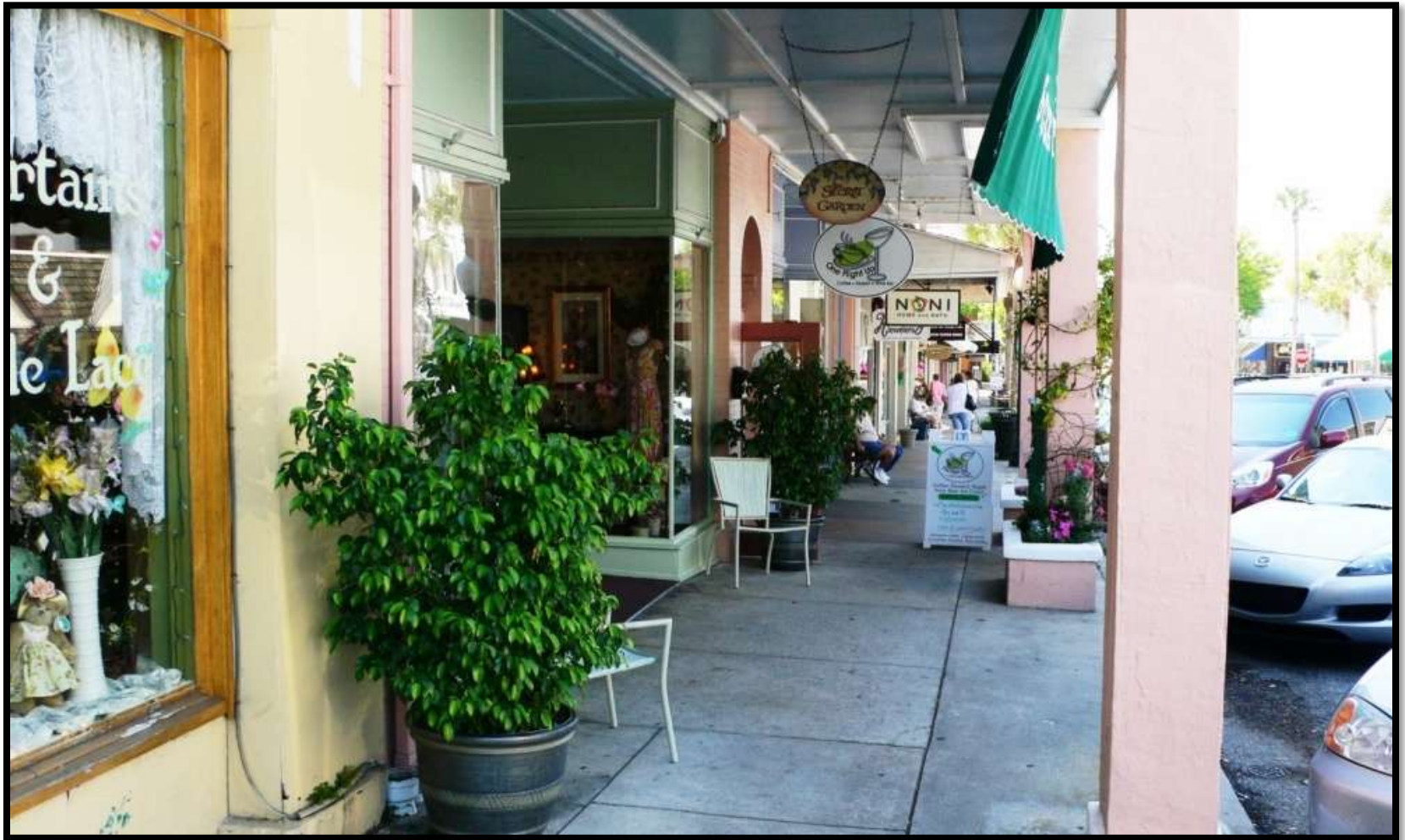
Commercial Streetscape – Mt. Dora, FL