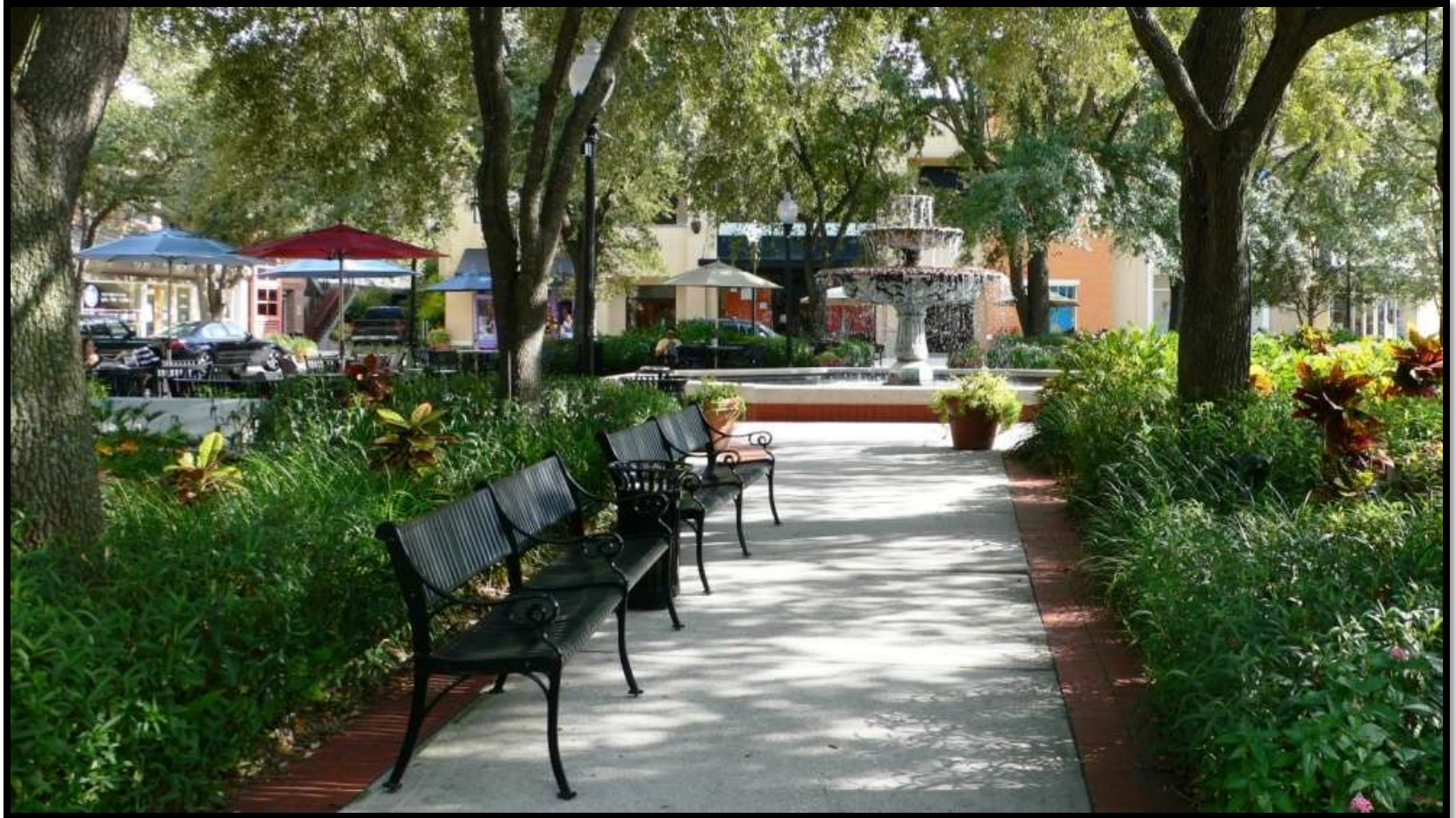
Open Space – Tampa, FL