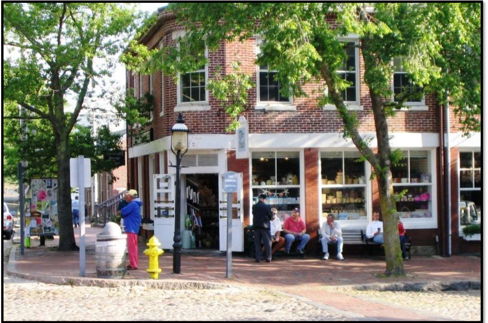
Commercial Center – Nantucket, MA