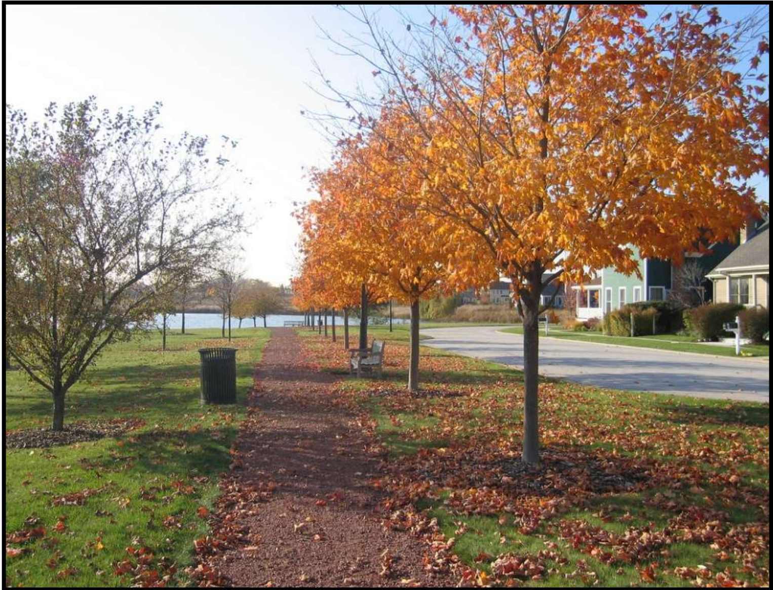
Residential Trail and Greenspace – Greys Lake, IL