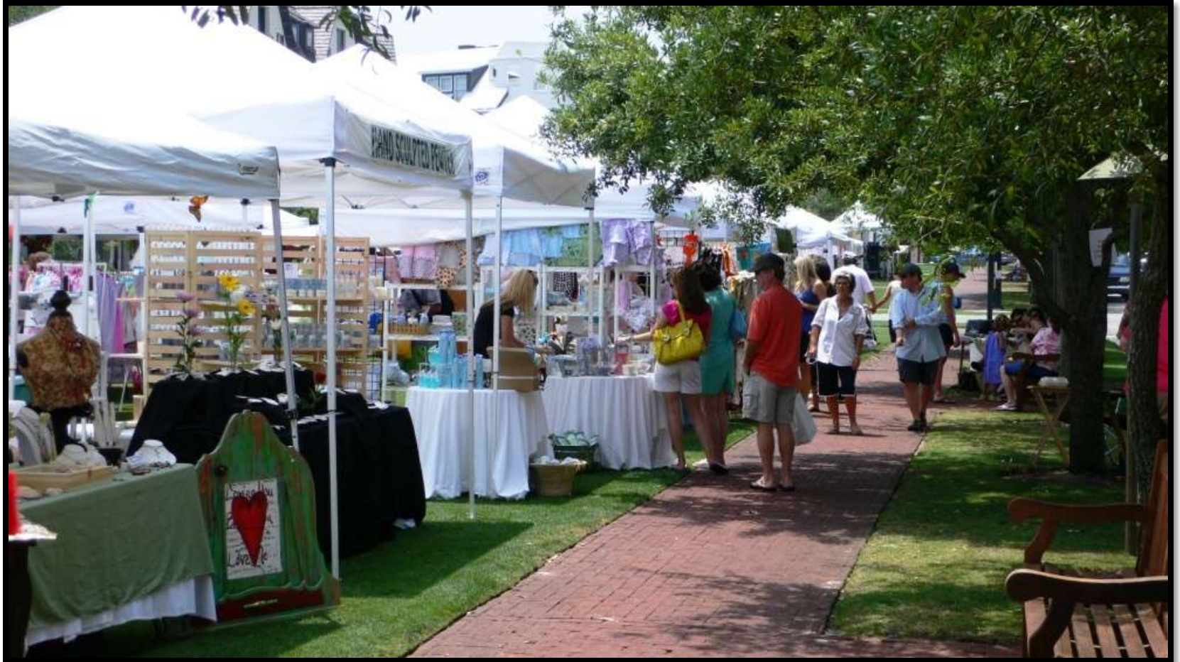
Barrett Square Festival – Rosemary Beach, FL