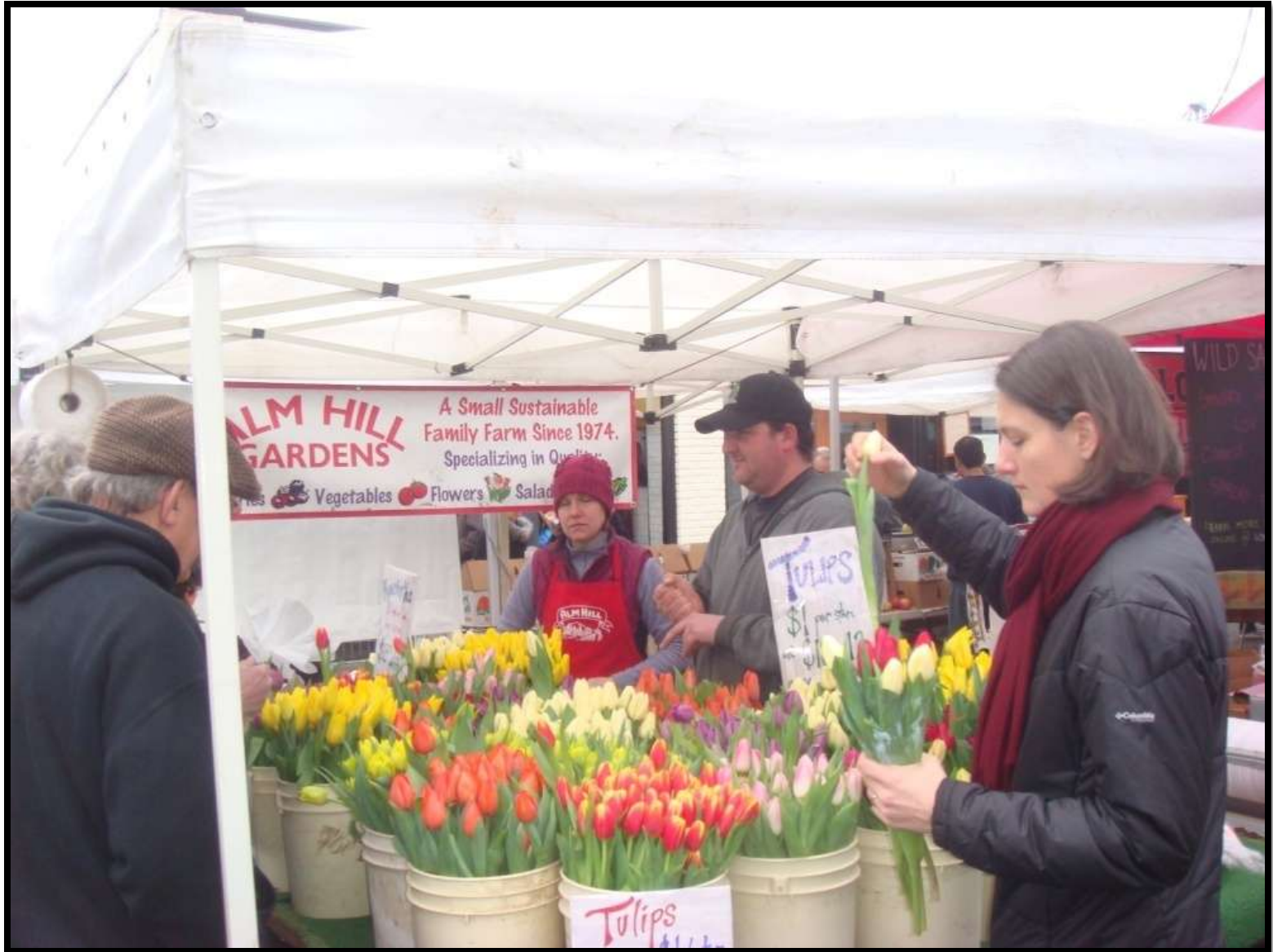
Farmer's Market – Ballard (Seattle), WA