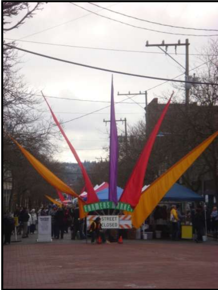
Farmer's Market – Ballard (Seattle), WA