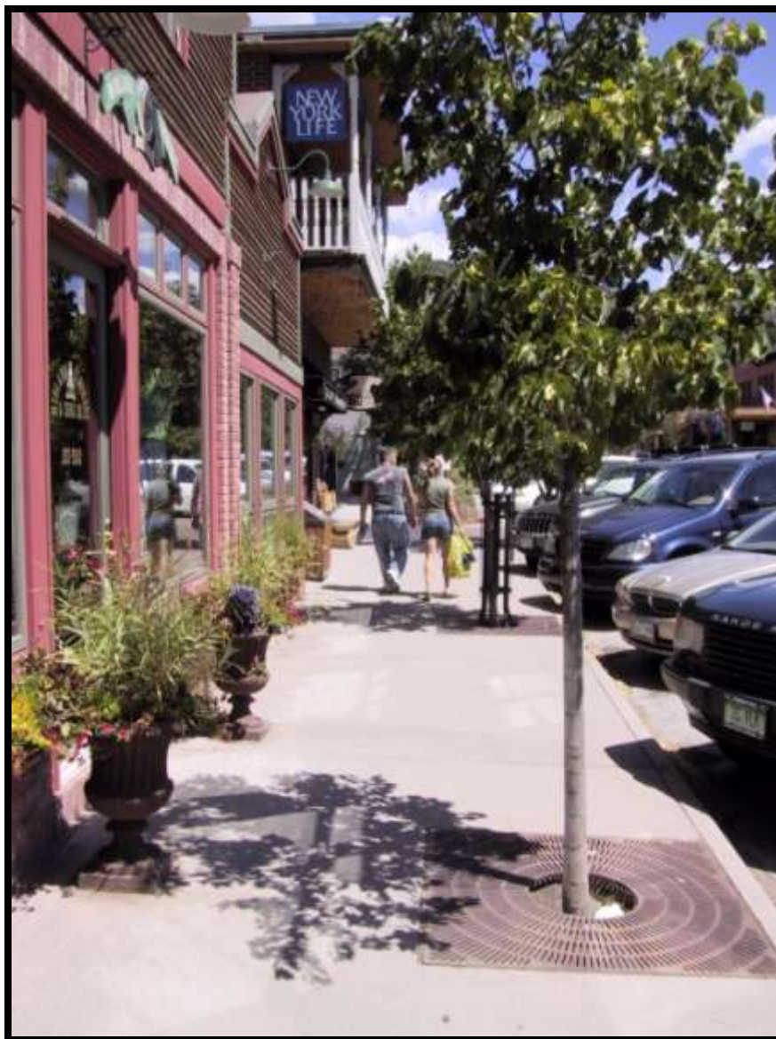
Streetscape – Basalt, CO