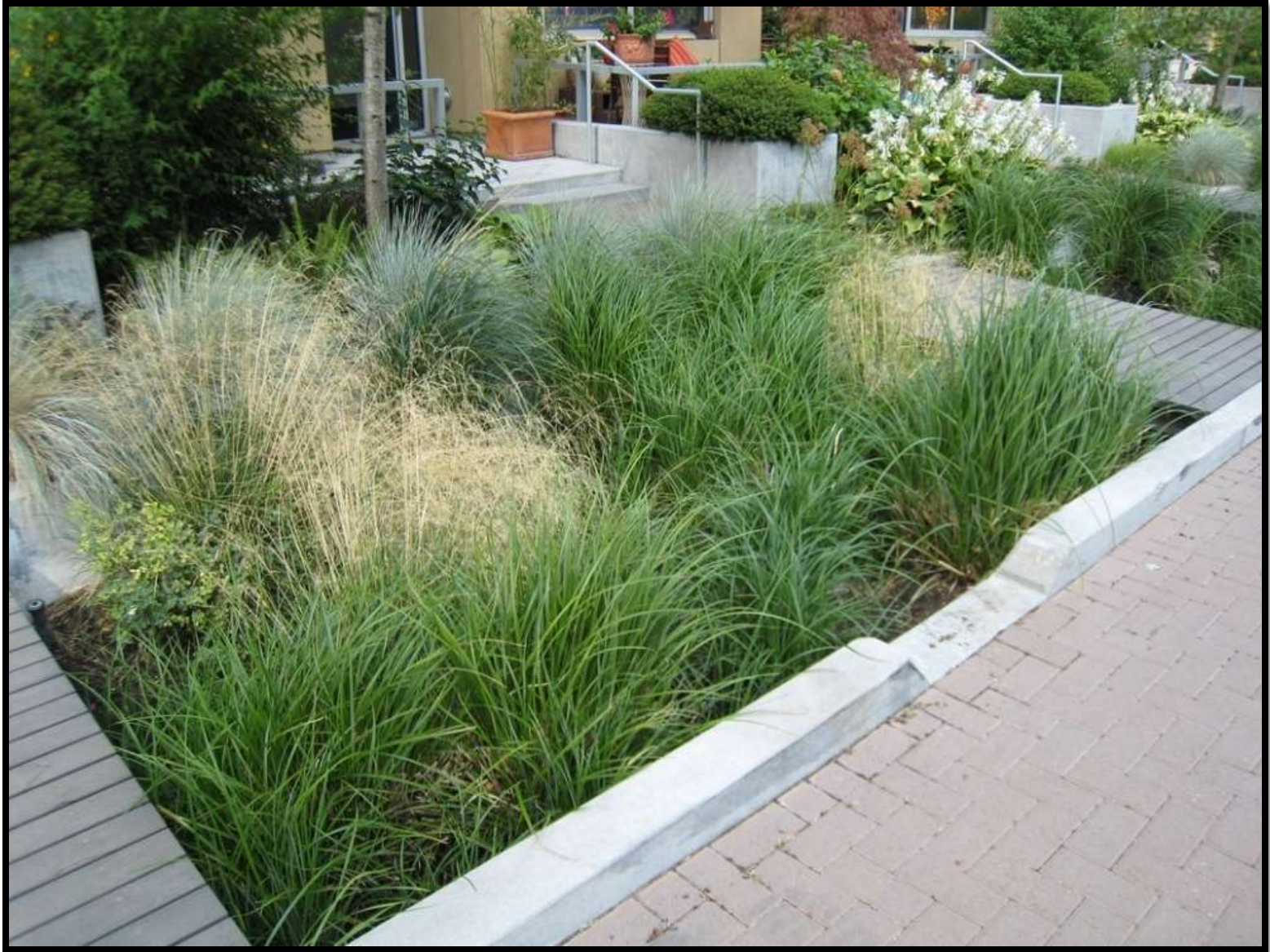
Low Impact Development – Portland, OR