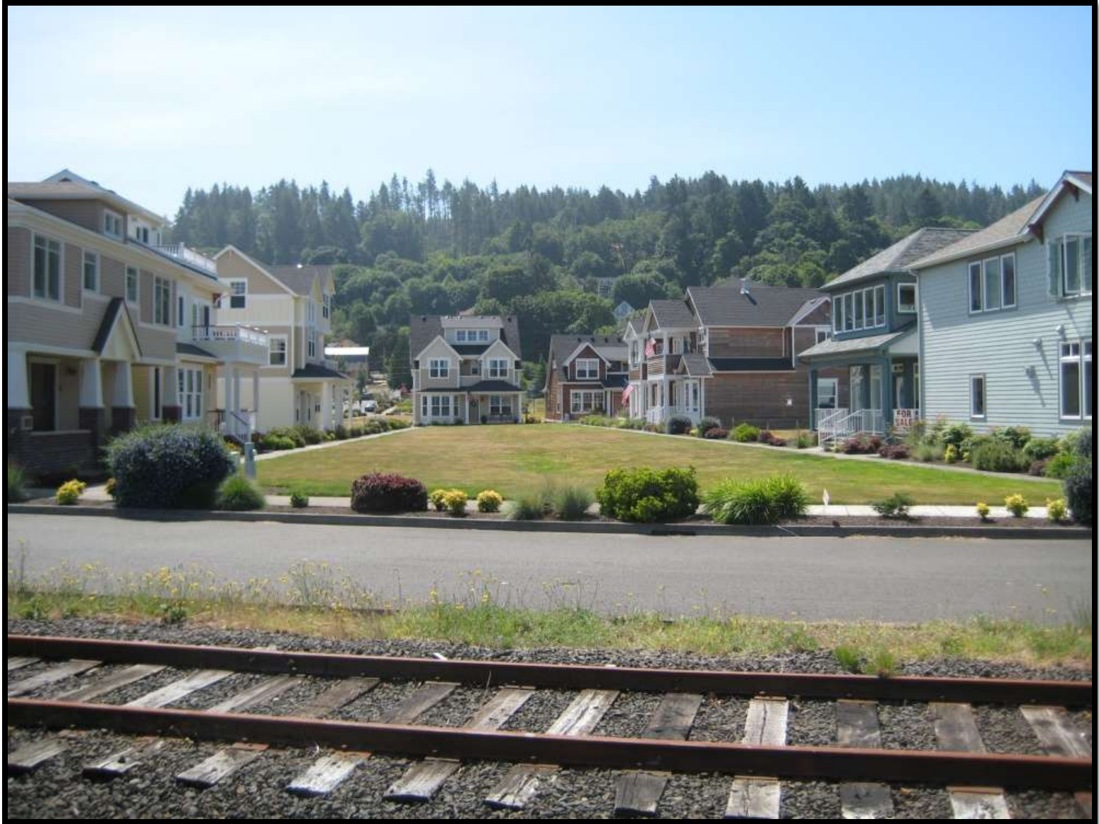
Residential – Astoria, OR