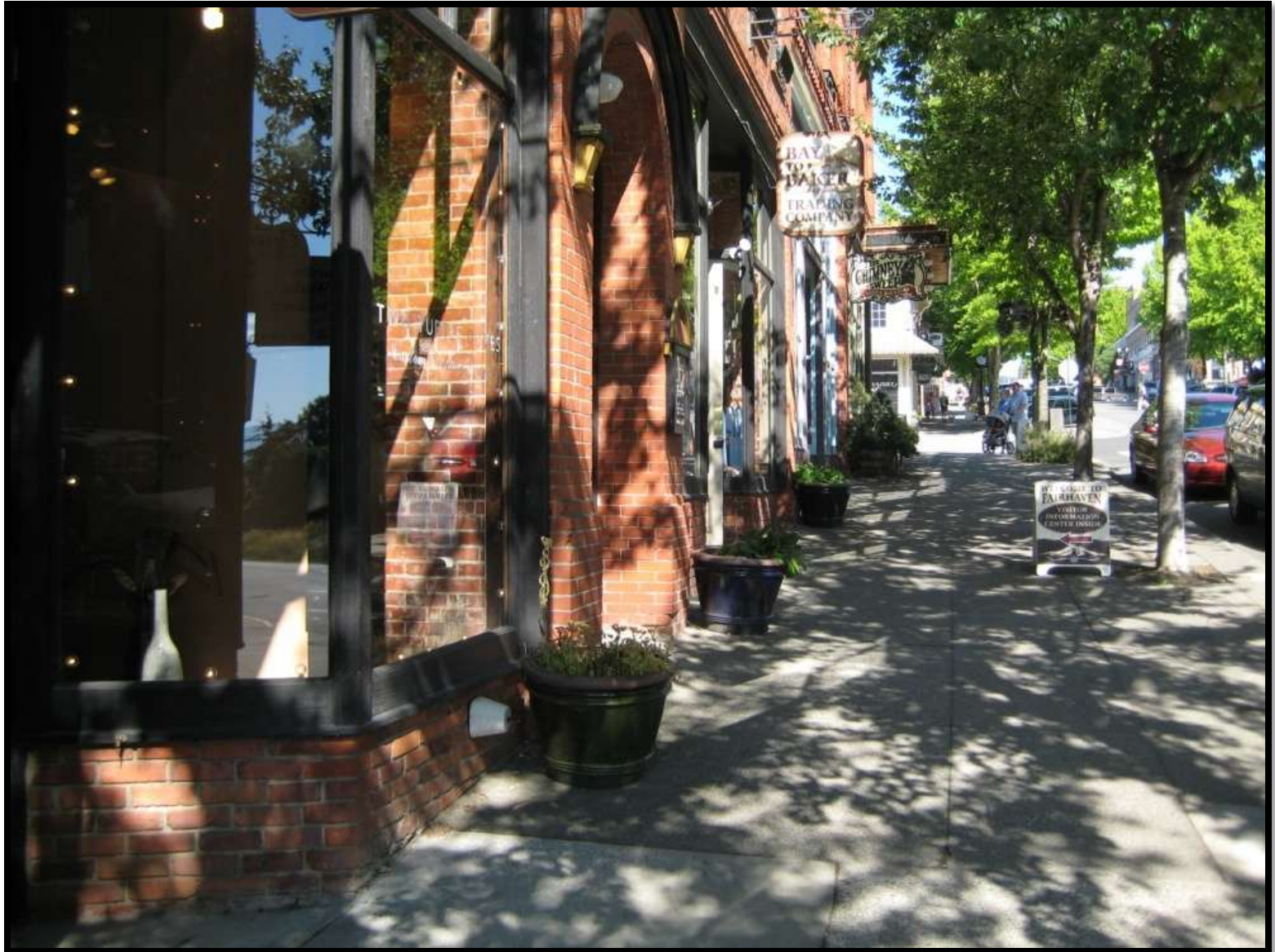
Streetscape – Bellingham, WA