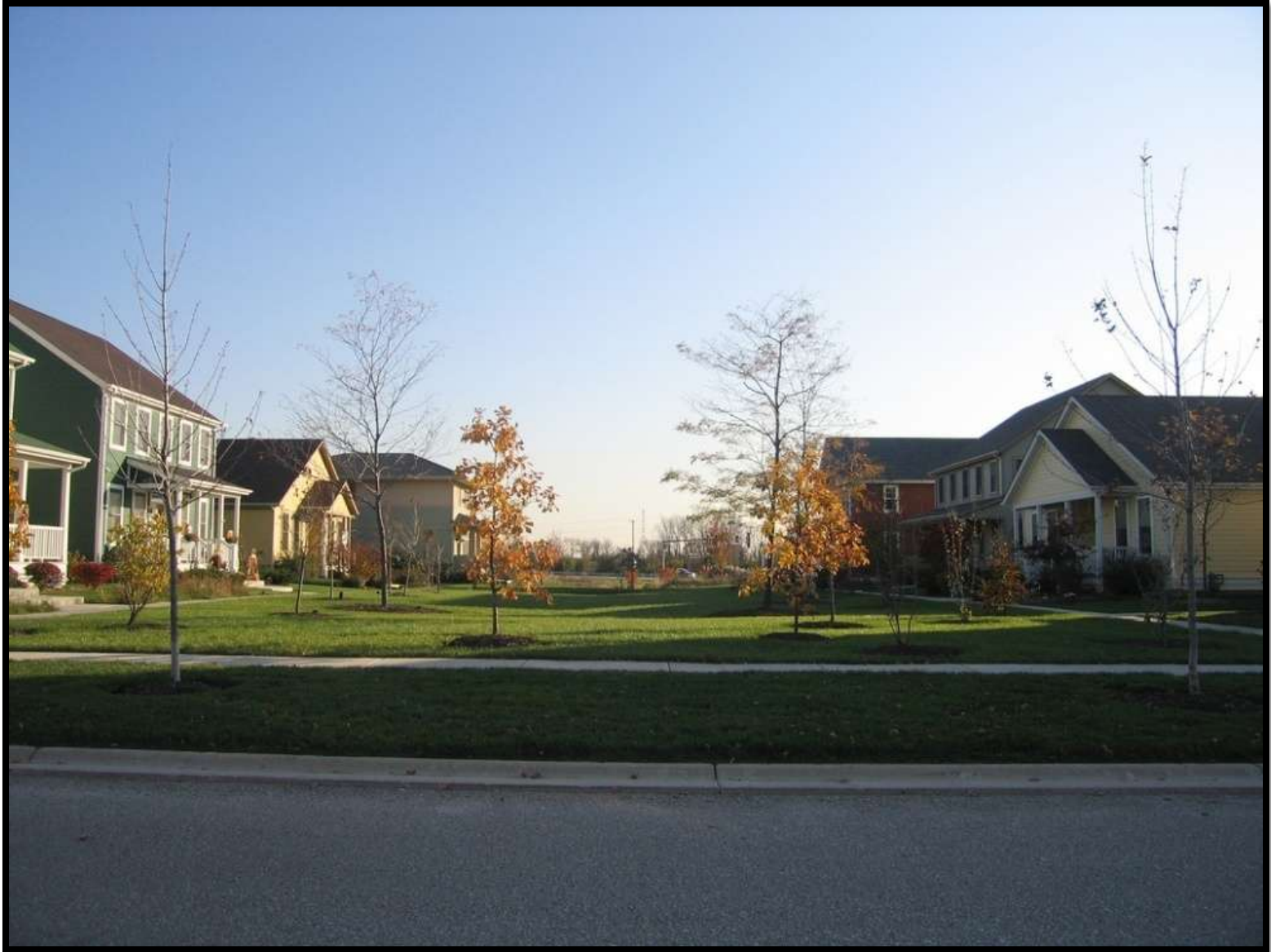
Residential Passive Green Space– Greys Lake, IL