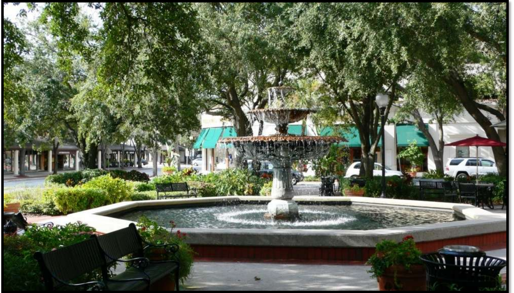
Open Space – Tampa, FL