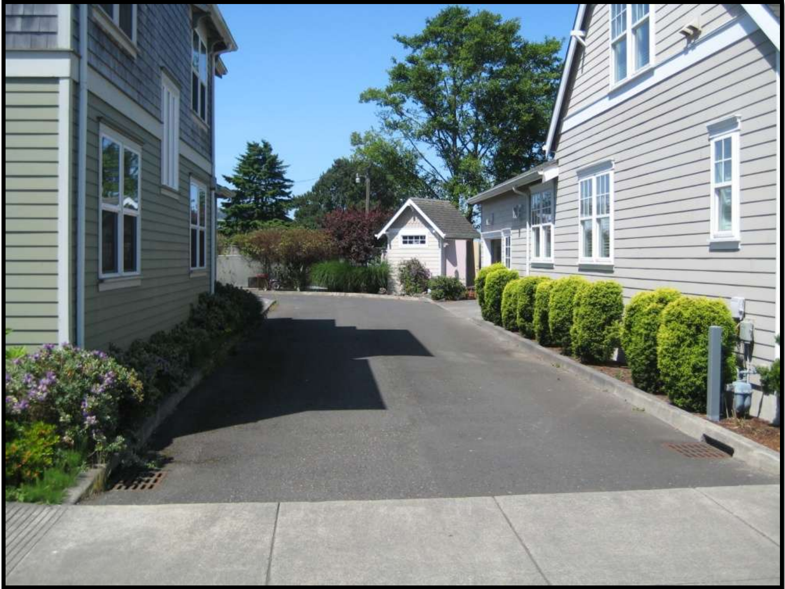
Residential – Astoria, OR