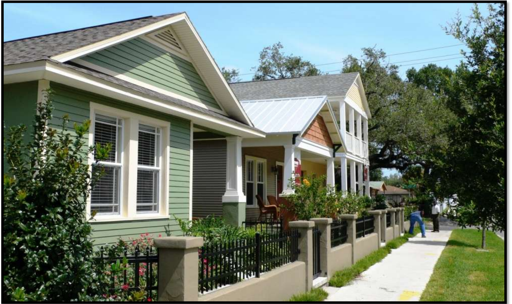
Residential – Tampa, FL