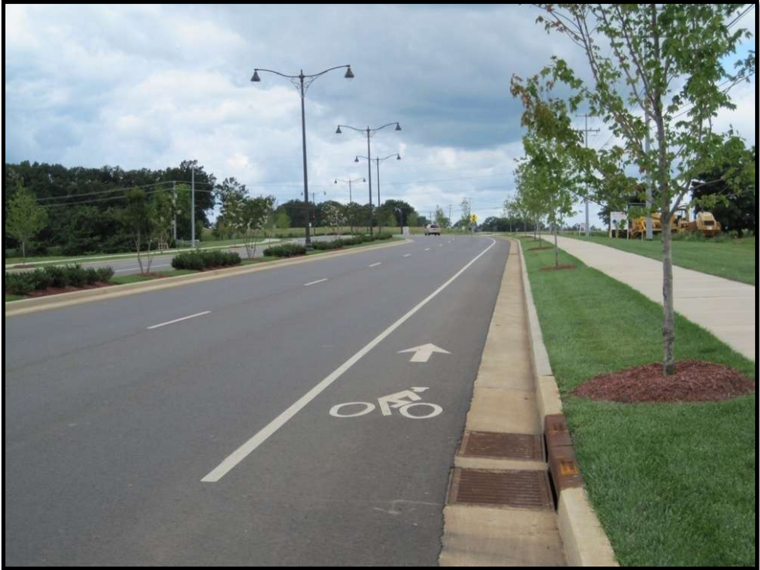
Bike Lane – Clarksville, TN