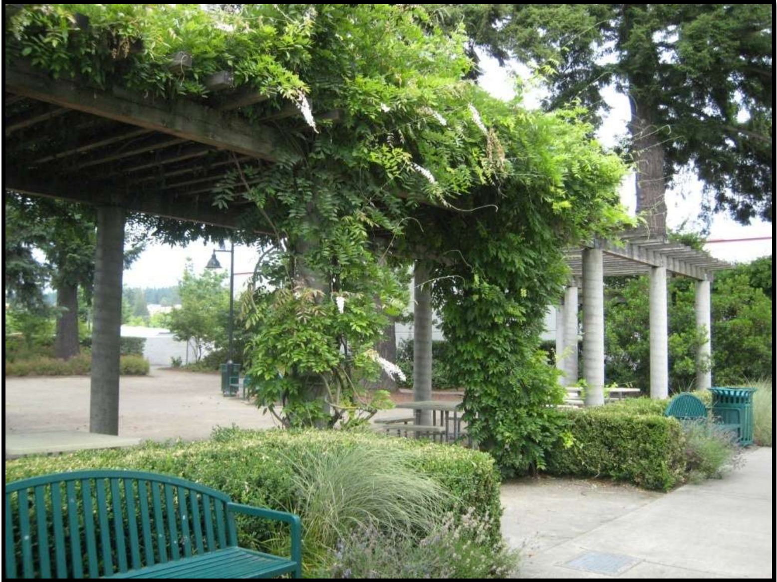
DeYoung Park – Woodinville, WA