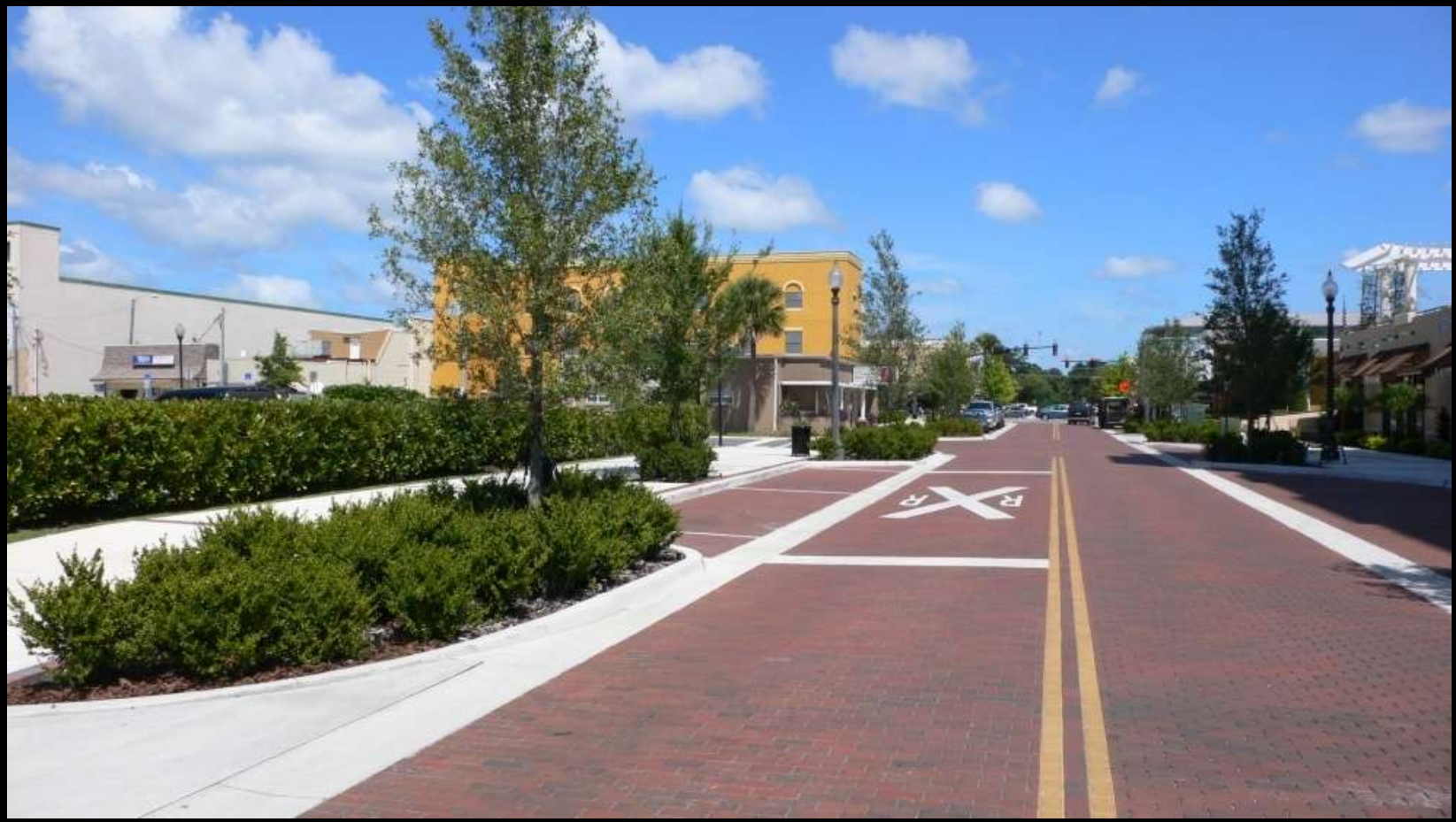
Streetscape – Kissimmee, FL