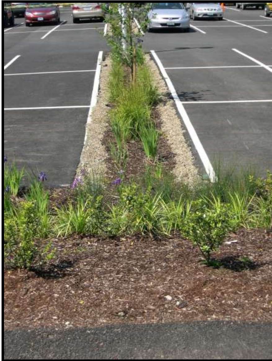
Low Impact Development – Portland, OR