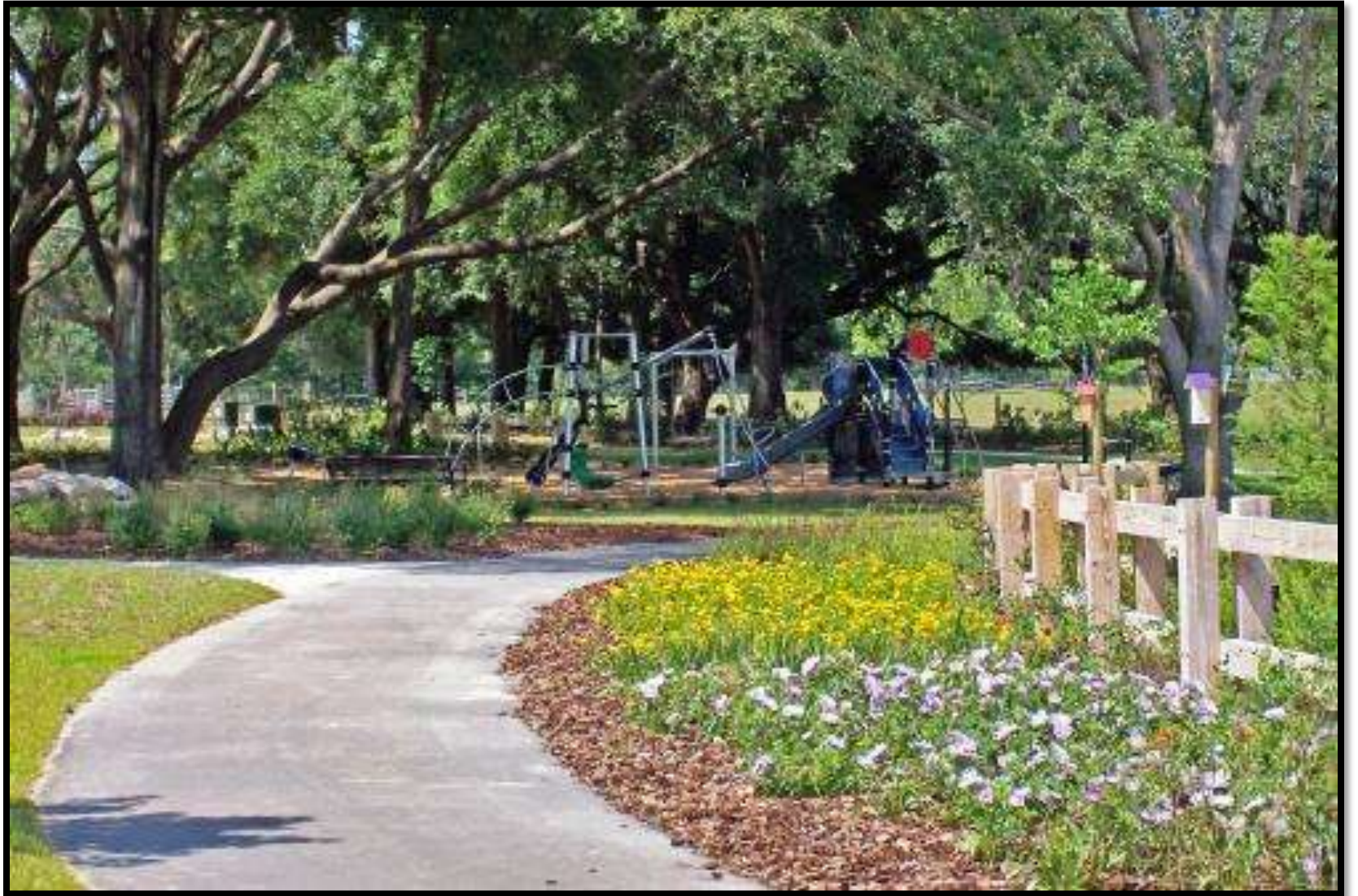
Trail and Tot Lot – Gainesville, FL