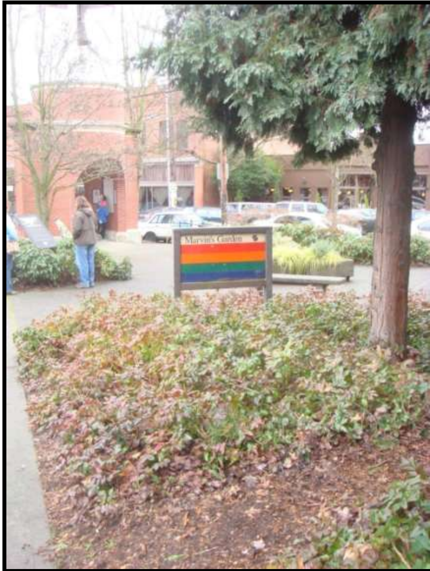
Pocket Park – Ballard, WA