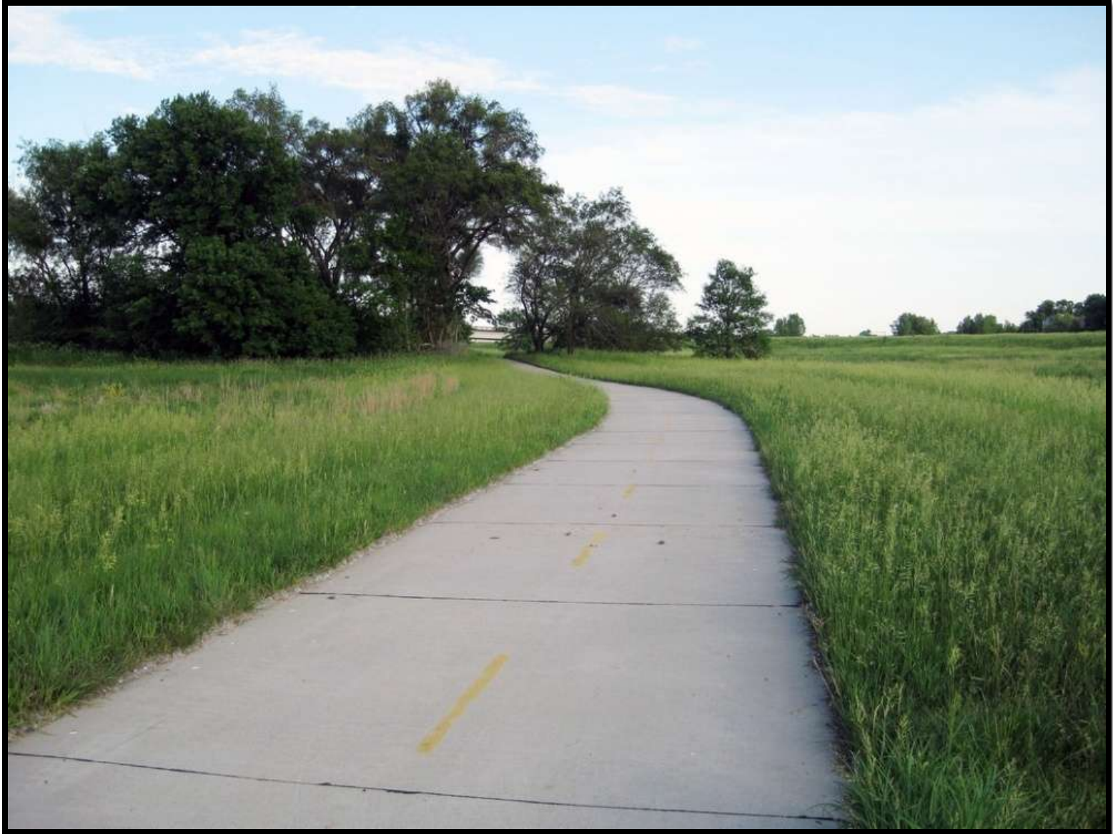
Multi-use Trail – Bellevue, WA