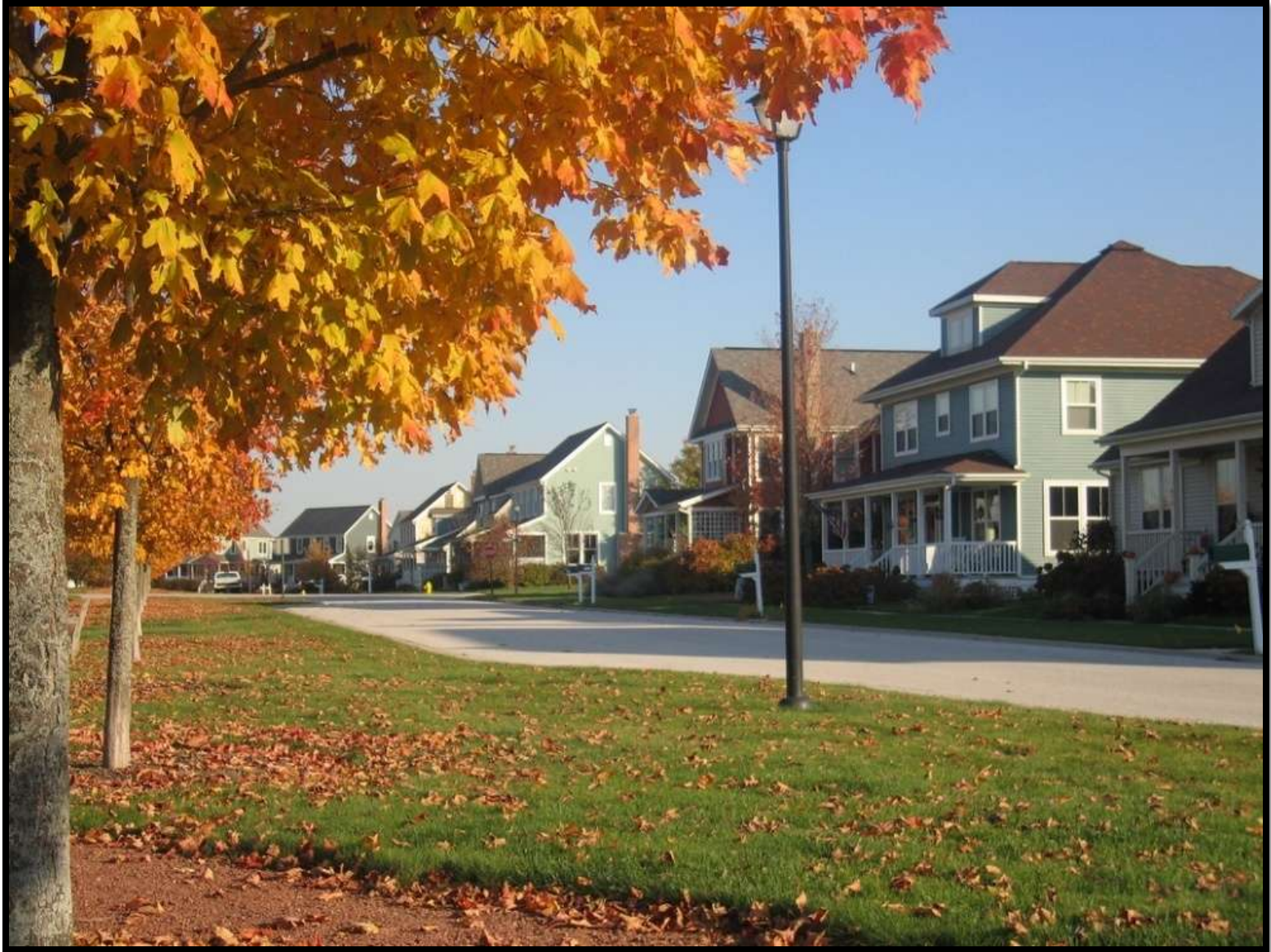
New Urban Neighborhood – Greys Lake, IL