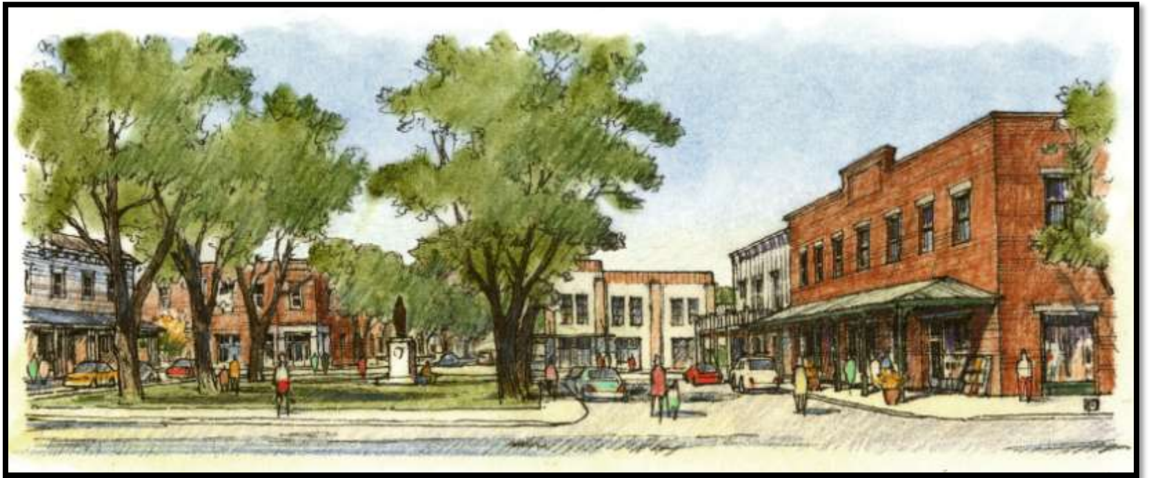
Community Center Rendering