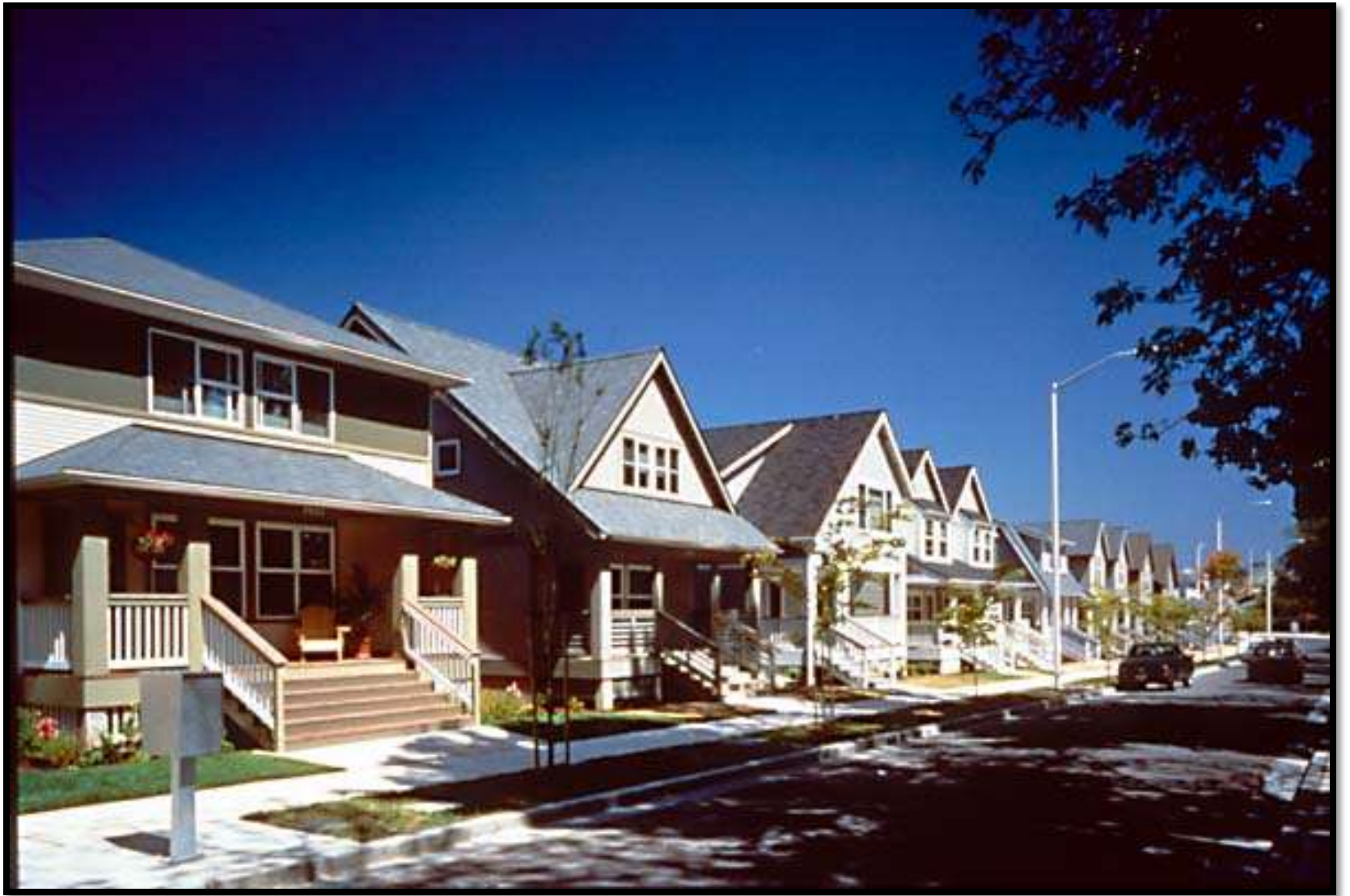
New Urbanism Neighborhood – Seattle, WA