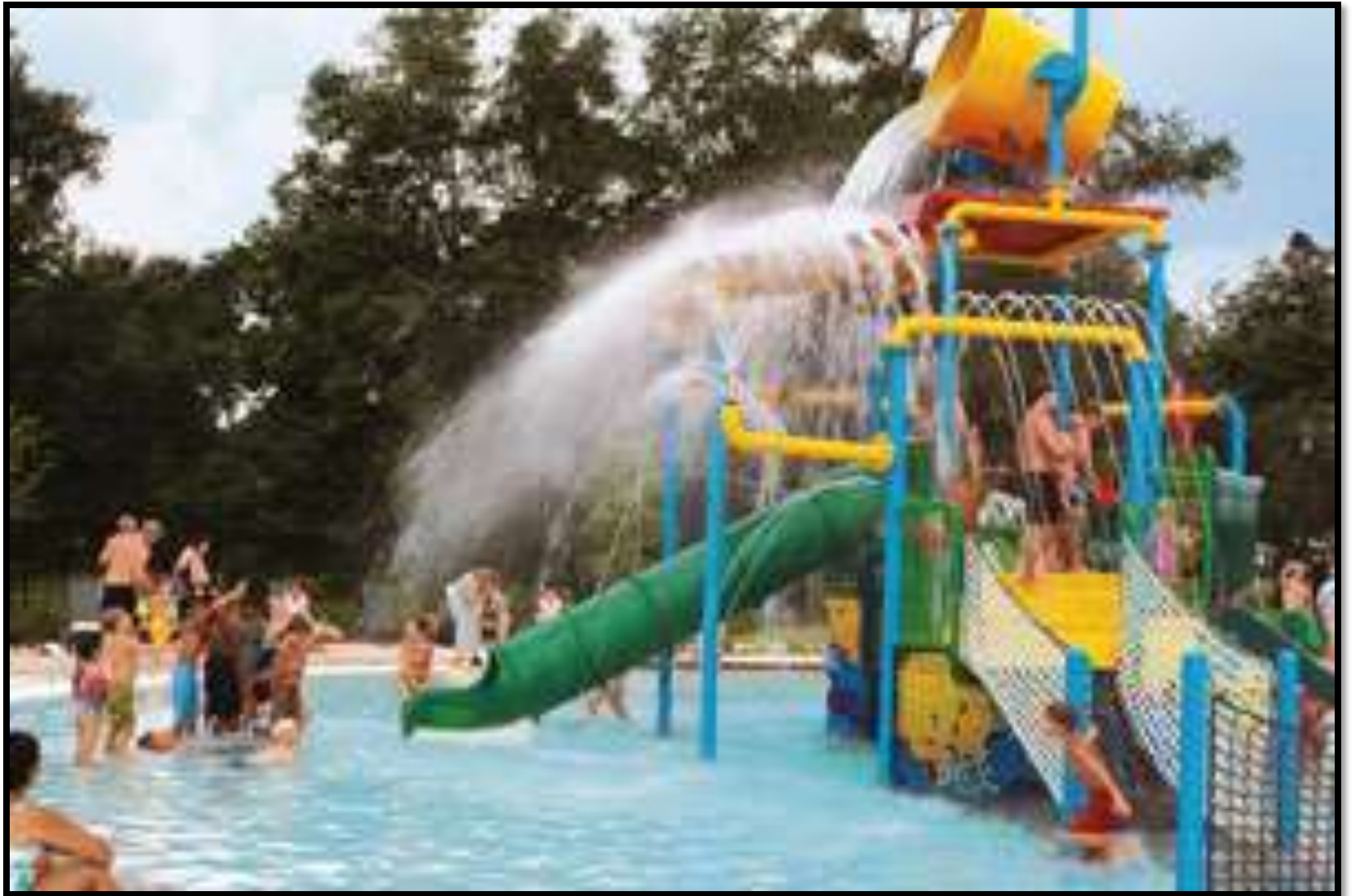
Community Center – Southwood, FL