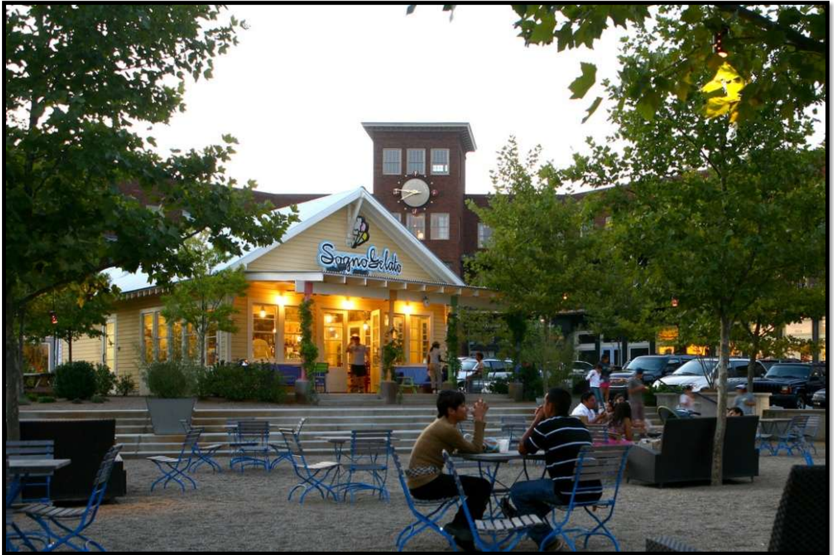
Commercial Gathering Space - Atlanta, GA