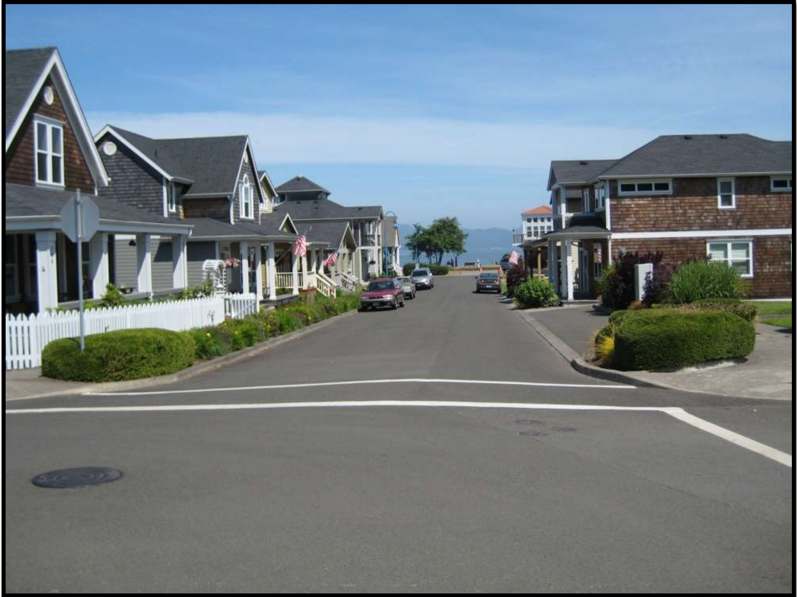
Residential – Astoria, OR