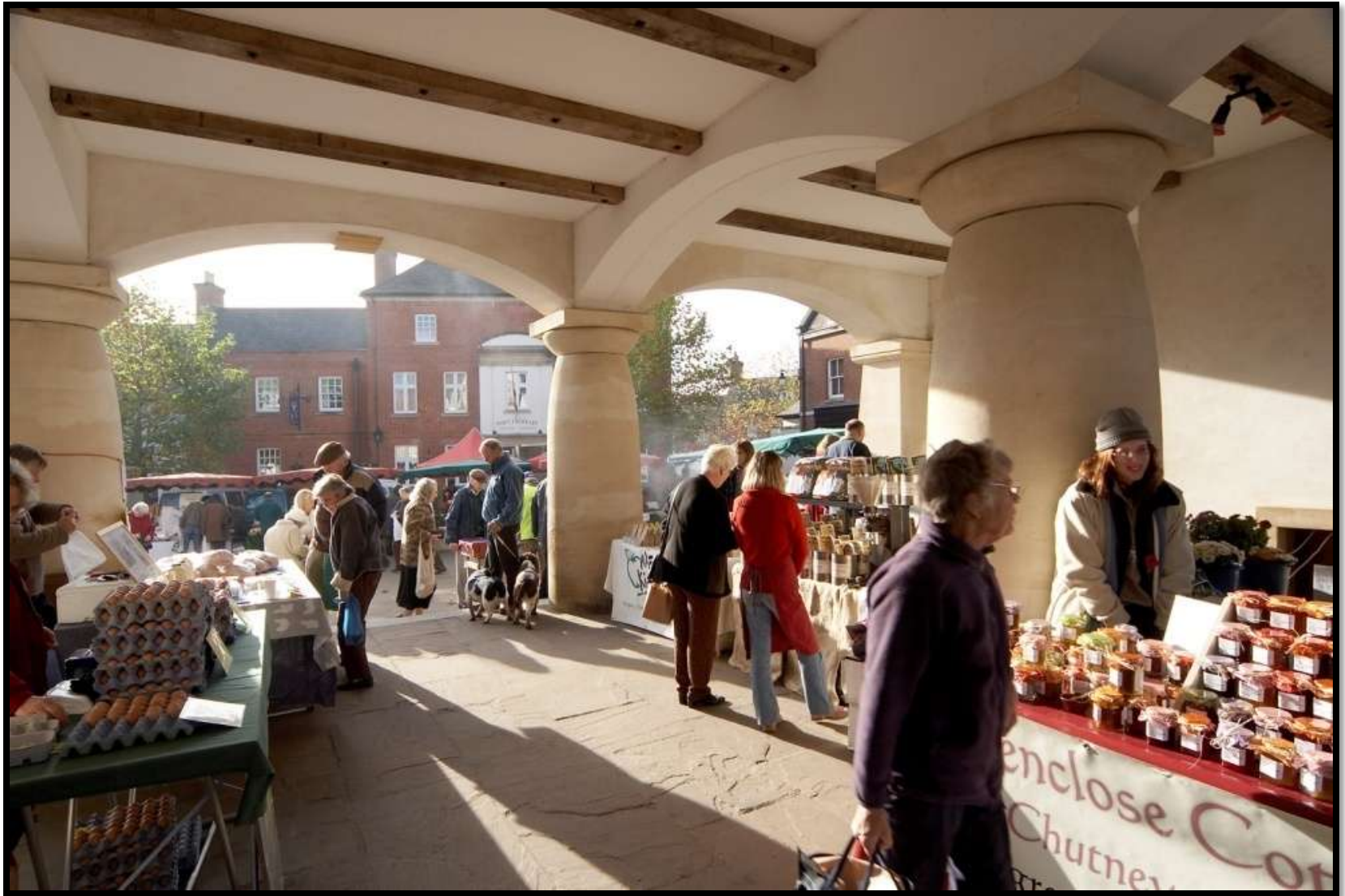
Farmer's Market – Dorchester, England