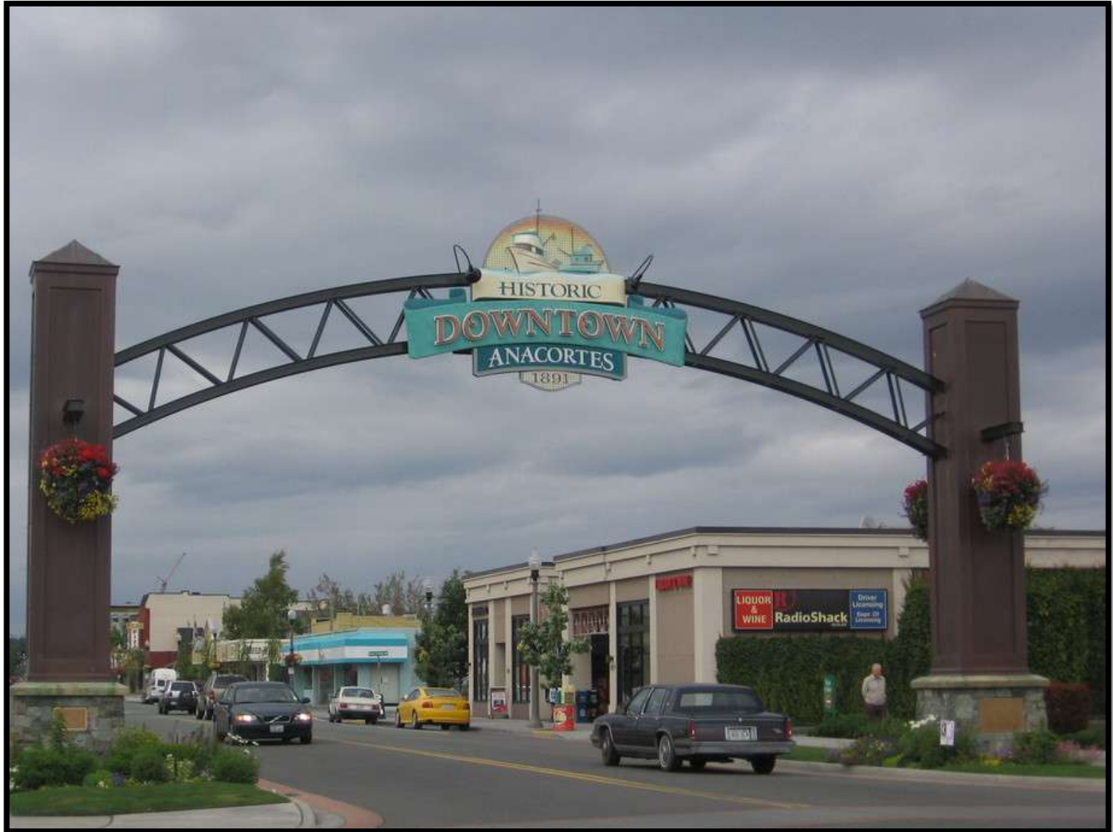
Gateway – Anacortes, WA