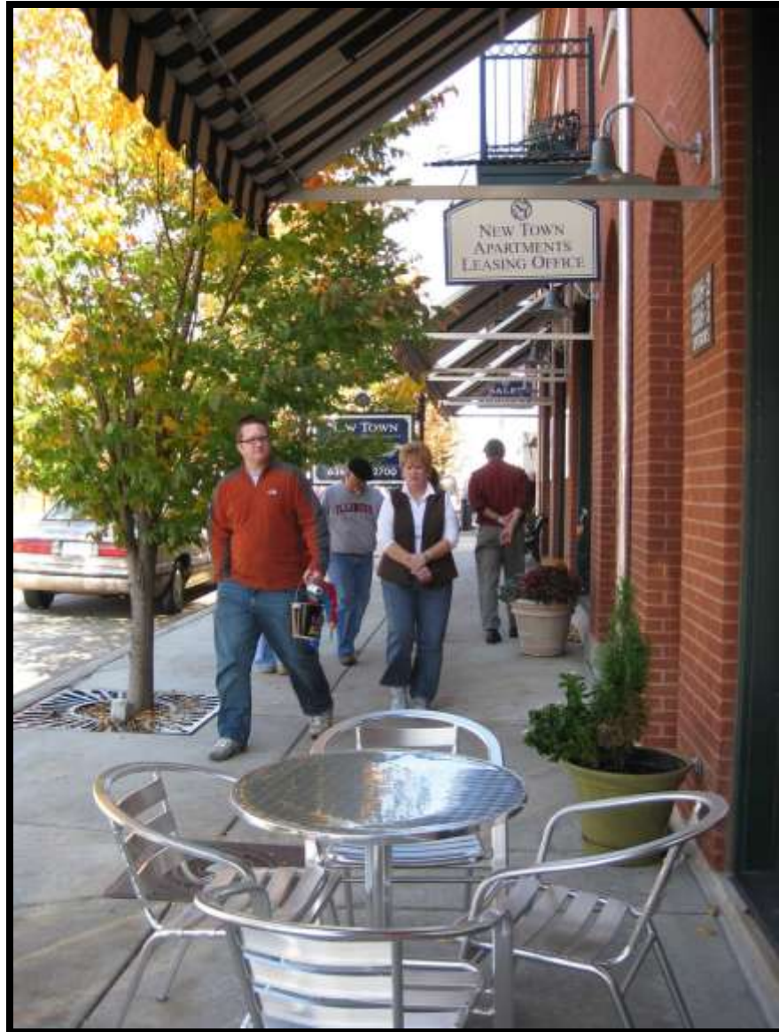
Sidewalk Cafe - St Charles, MO