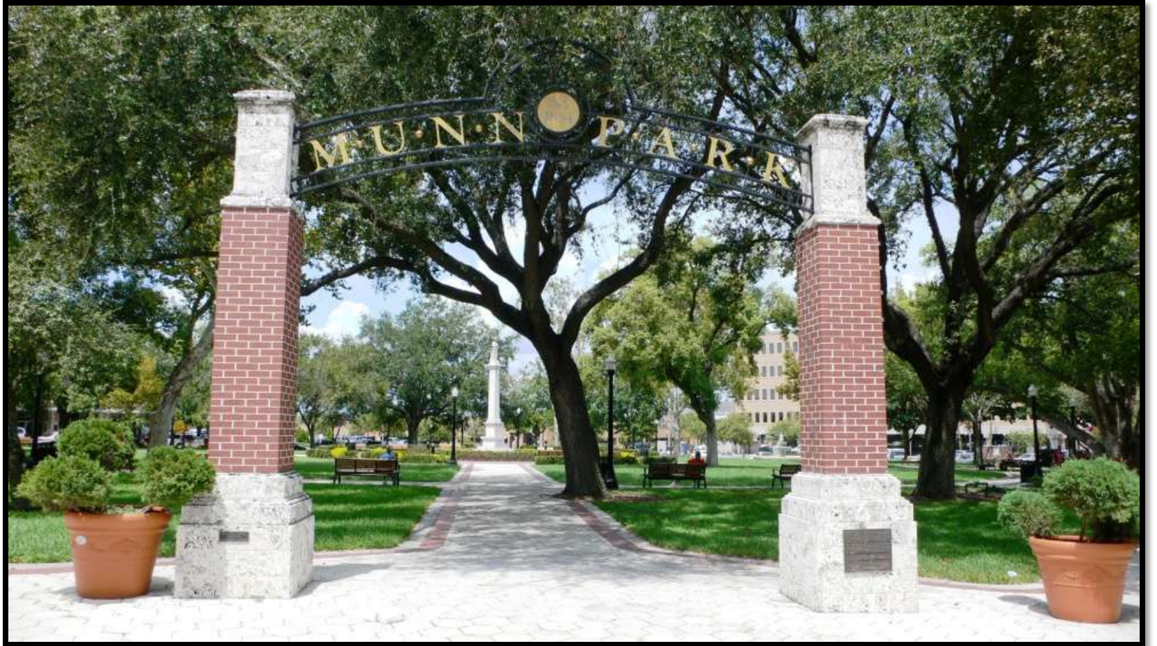
Gateway – Lakeland, FL