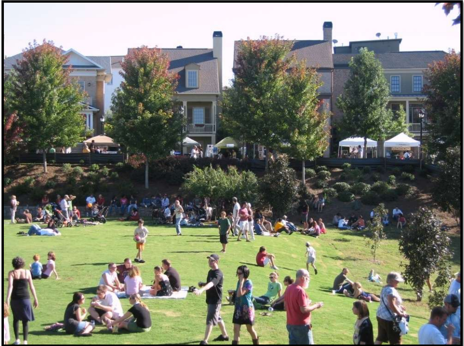
Open Space – Atlanta, GA