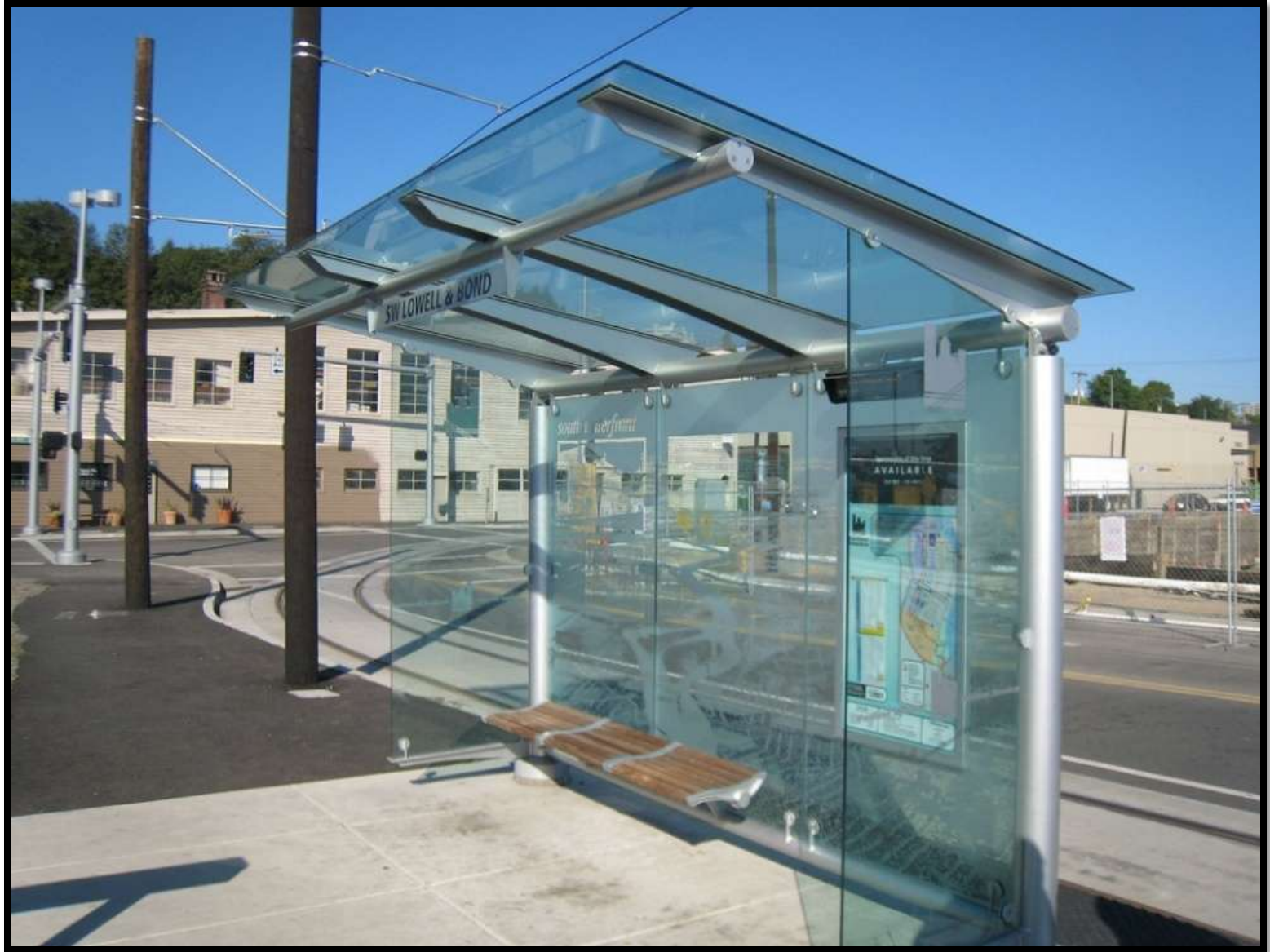
Transit Stop – Portland, OR