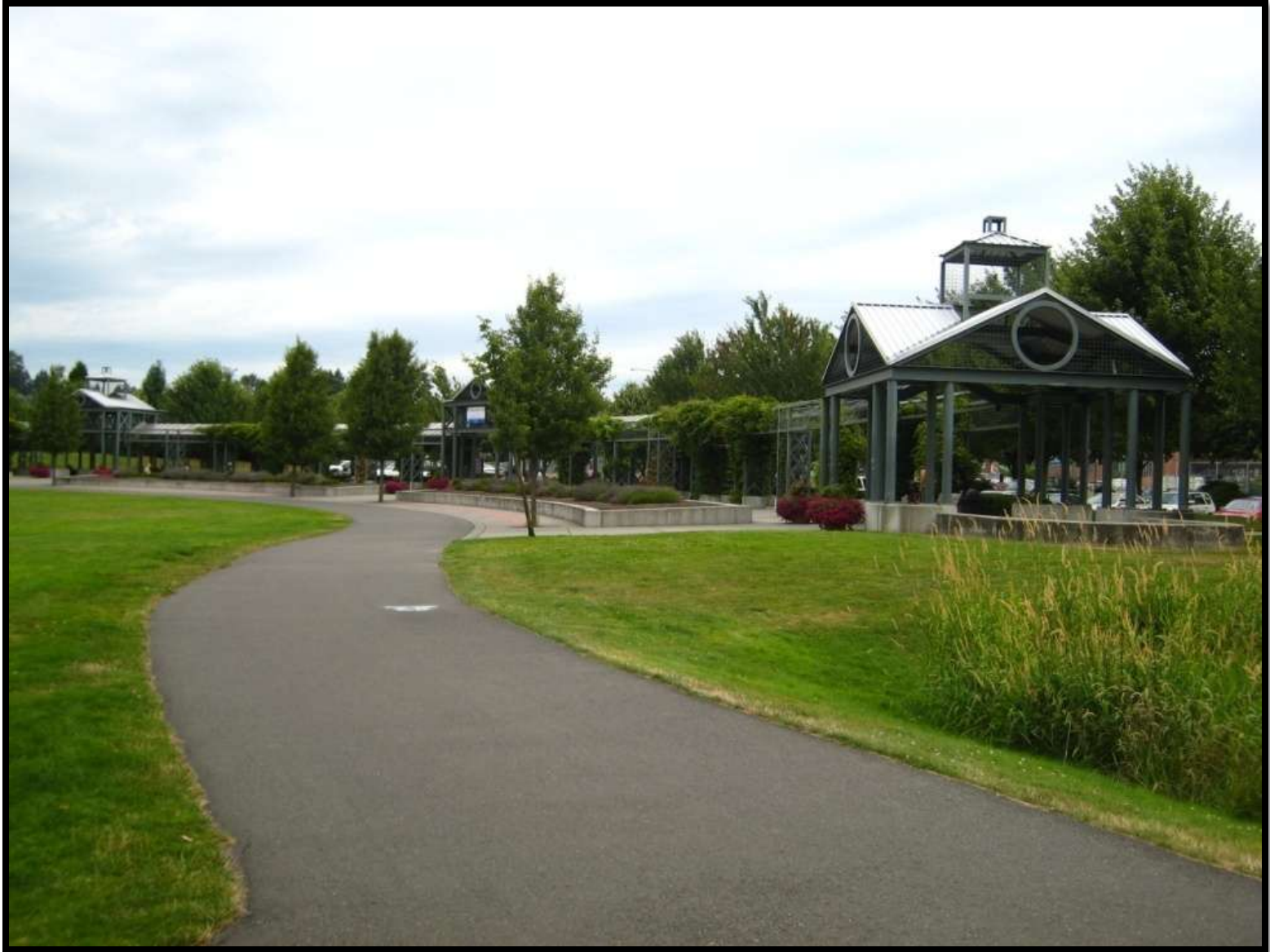
Gateway – Woodinville, WA