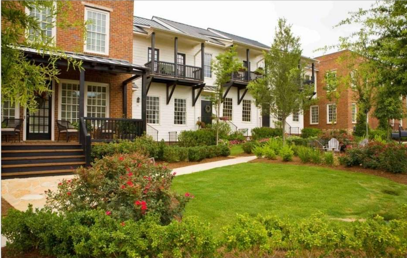
Residential Passive Green Space - Woodstock, GA

Residential units front passive greenspaces throughout the project.