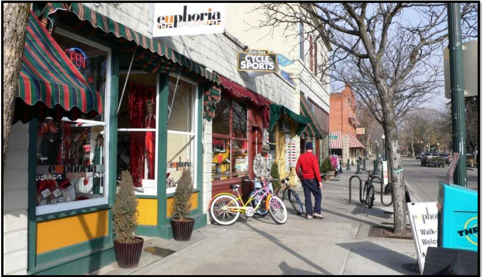
Commercial Streetscape – Boise, ID