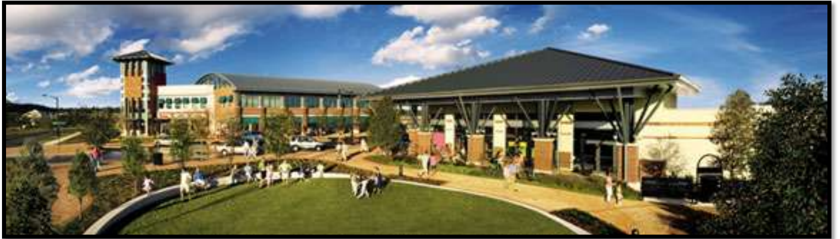
Town Center – Southwood, FL