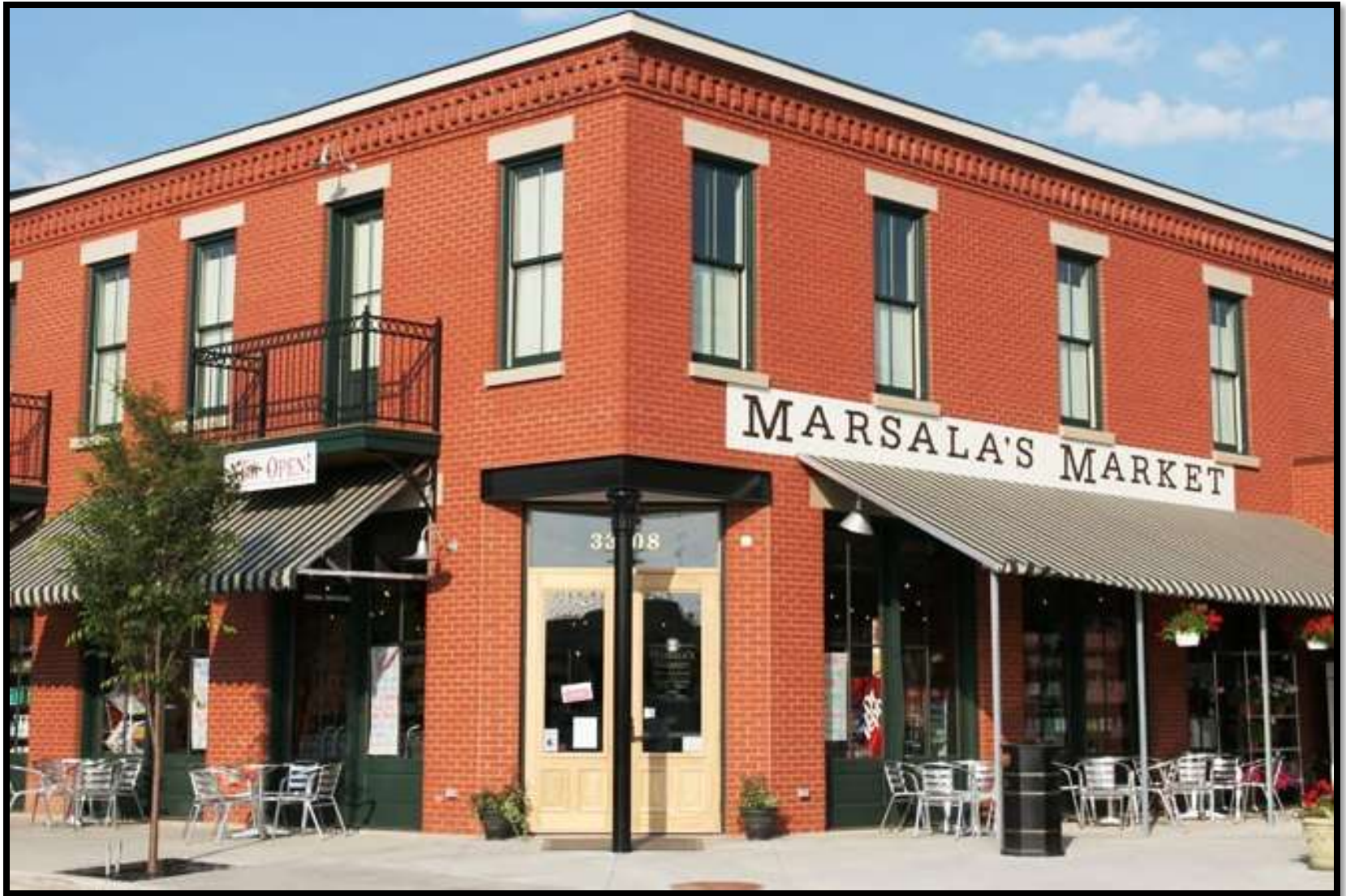
Mixed Use – Charles Town, MO