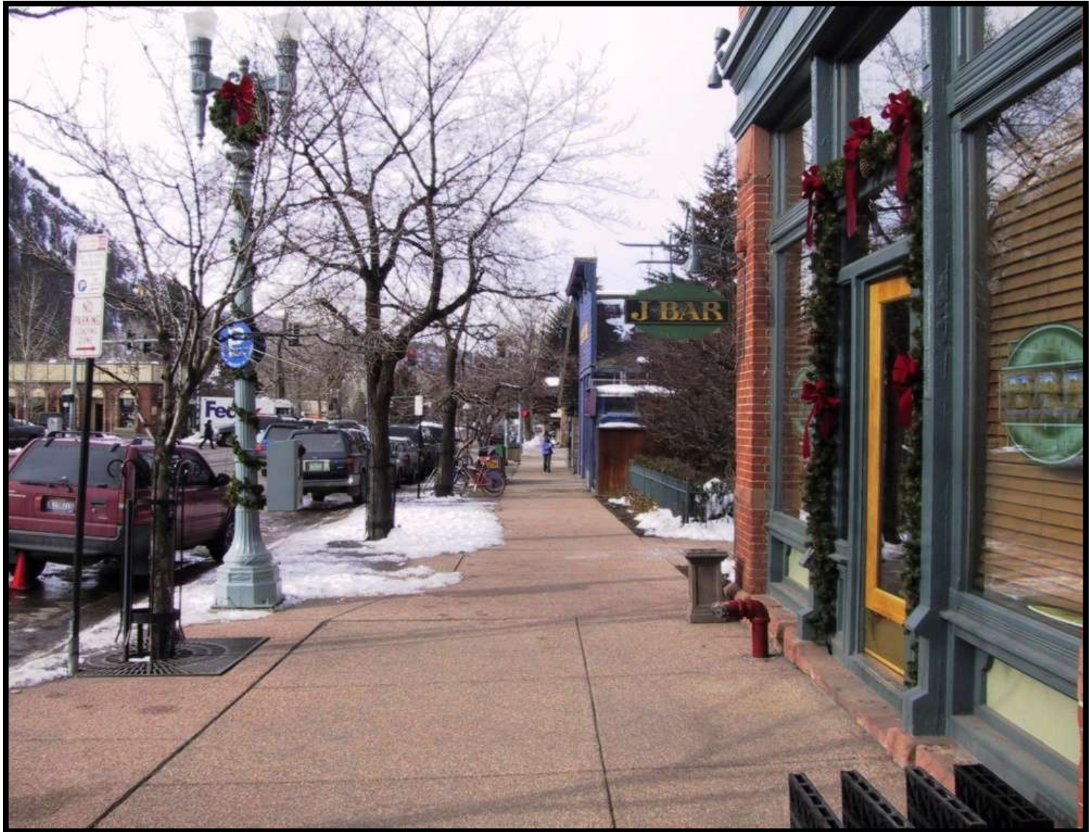
Streetscape – Aspen, CO