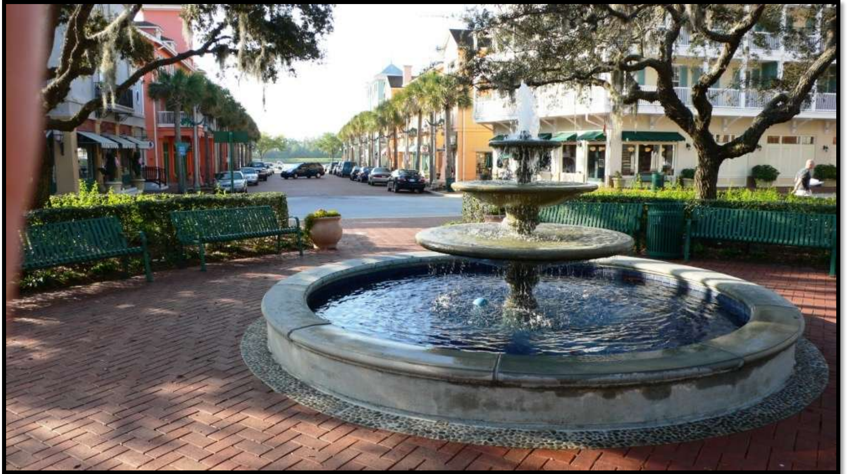
Open Space – Celebration, FL