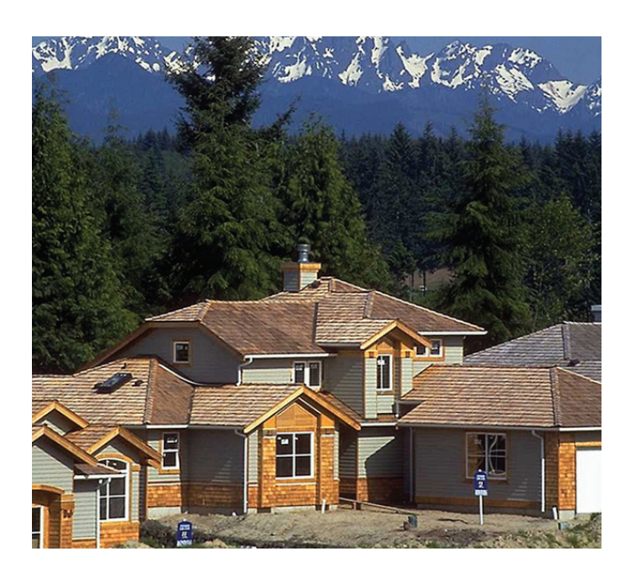
Figure 3 provides a view of the existing development in the Bayview Ridge Subarea.

The existing residential pattern within Bayview Ridge Subarea reflects a change in zoning over time in response to the development of County Plans and more recently, in response to GMA requirements. Although the eastern portion of the Subarea has always been considered residential (as opposed to industrial or agriculture), a mix of urban and rural residential development currently exists. The present zoning, Rural Reserve and Rural Intermediate reflects current GMA requirements regarding rural designations for properties outside an UGA. The existing Bayview Ridge residential subdivisions are zoned Rural Intermediate, and undeveloped and large-lot properties are zoned Rural Reserve. The area was downzoned to rural standards in 1998 in response to the GMA and a Western Washington Growth Management Hearings Board compliance order. Urban development was not allowed outside UGAs and this area was not designated as such. The Bayview Ridge Subarea Plan establishes a UGA at Bayview Ridge that acknowledges and makes the most of the existing urban infrastructure and residential development at urban densities.