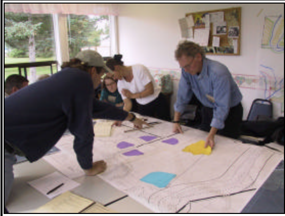
Design team hard at work during the October Charette

In the analysis phase, the planning team reviewed and discussed all of the background information collected. Then, through a consensus driven process, a draft list of design elements was developed for the types of facilities to include at NSRA that reflected the desires and needs of the general public and key stakeholders. This list was presented to the citizen advisory committee and was enthusiastically supported and adopted by this group in July of 2001. (See Appendix C - Design Elements)