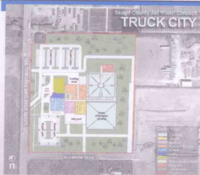
Truck City / Suzanne Lane Site