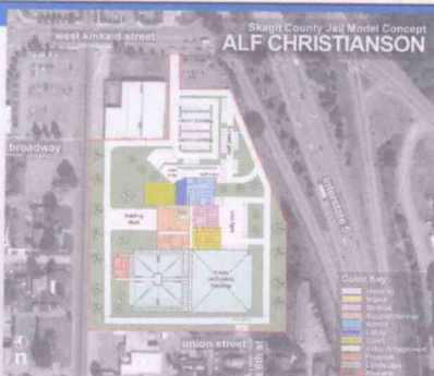
Alf Christianson Seed Site