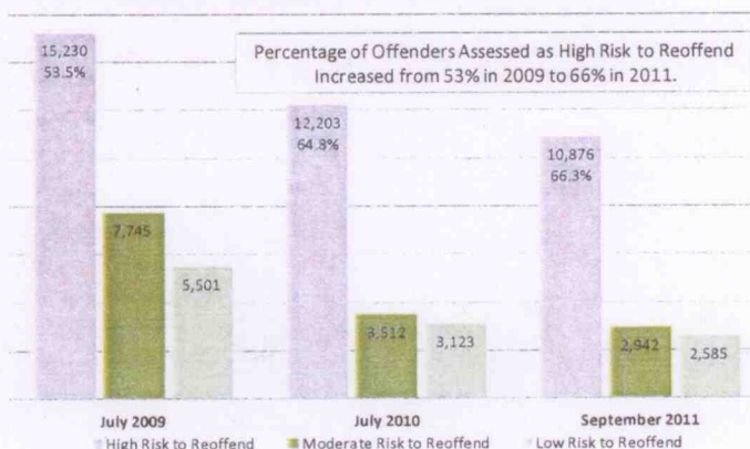
Chart 1: Change in distribution of risk level after major law changes

The cumulative effect of these laws is a smaller, higher-risk offender population. Two-thirds of offenders supervised in the community today are considered high risk to reoffend. And more than half, fifty-three percent, of low- and moderate-risk offenders are supervised for violent crimes or sex offenses.