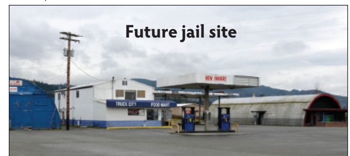
Former Truck City site, as viewed from Old Highway 99

Plans call to complete construction in early Spring 2017, with training and systems checks to follow before transfer of operations in early May.