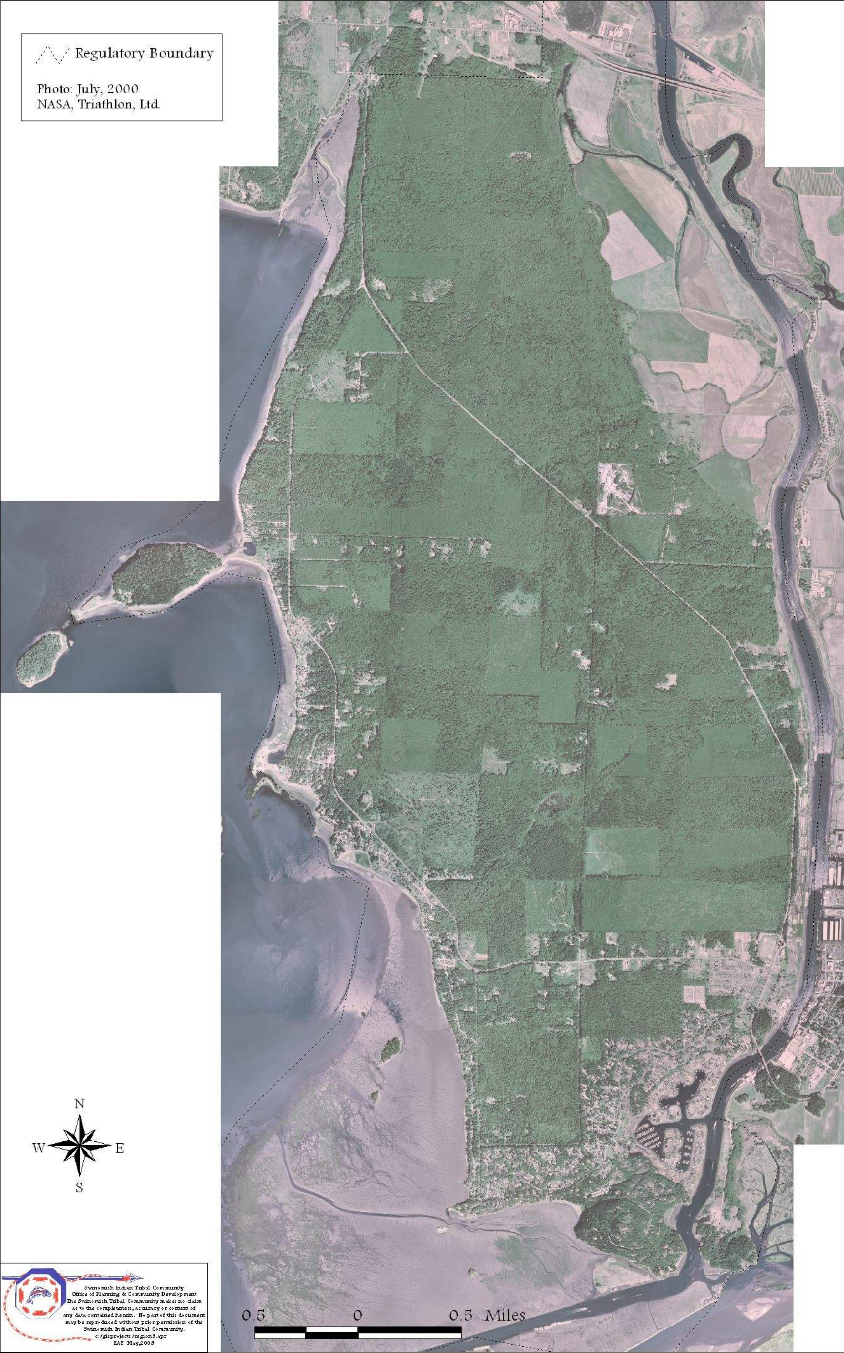
Figure 4: Aerial View of Swinomish Indian Reservation

Regulatory Boundary Photo: July, 2000 NASA, Triathlon, Ltd.