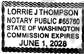
(Seal or stamp)

is the person who appeared before me, and said person acknowledged that he/she signed this instrument and acknowledged it to be his/her free and voluntary act for the uses and purposes mentioned in the instrument.