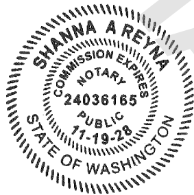
(Seal or stamp)

is the person who appeared before me, and said person acknowledged that he/she signed this instrument and acknowledged it to be his/her free and voluntary act for the uses and purposes mentioned in the instrument.