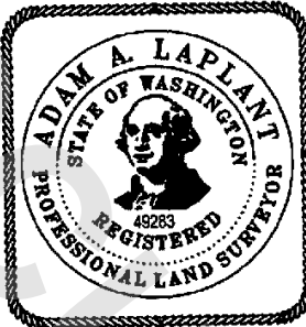
EXHIBIT C PARCEL P20245 - SUM-21 RECONDUCTOR