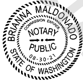
(Seal or stamp)

is the person who appeared before me, and said person acknowledged that he/she signed this instrument and acknowledged it to be his/her free and voluntary act for the uses and purposes mentioned in the instrument.