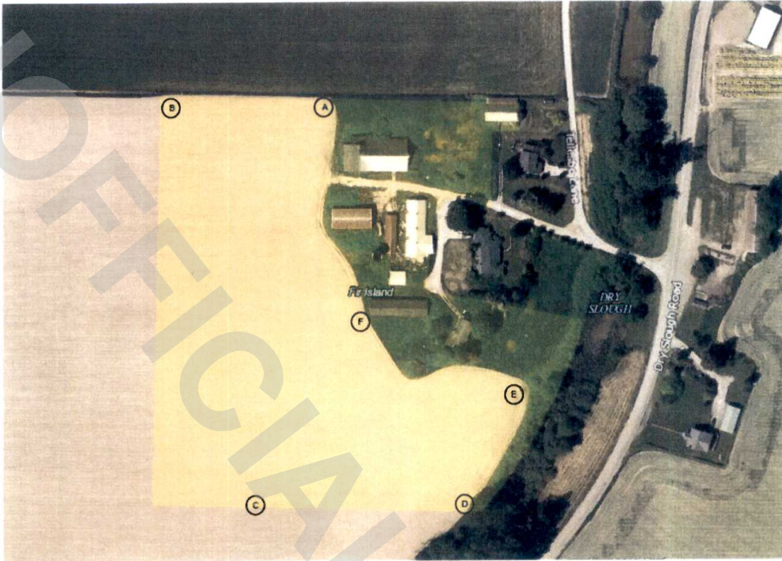
Photo locations A - F