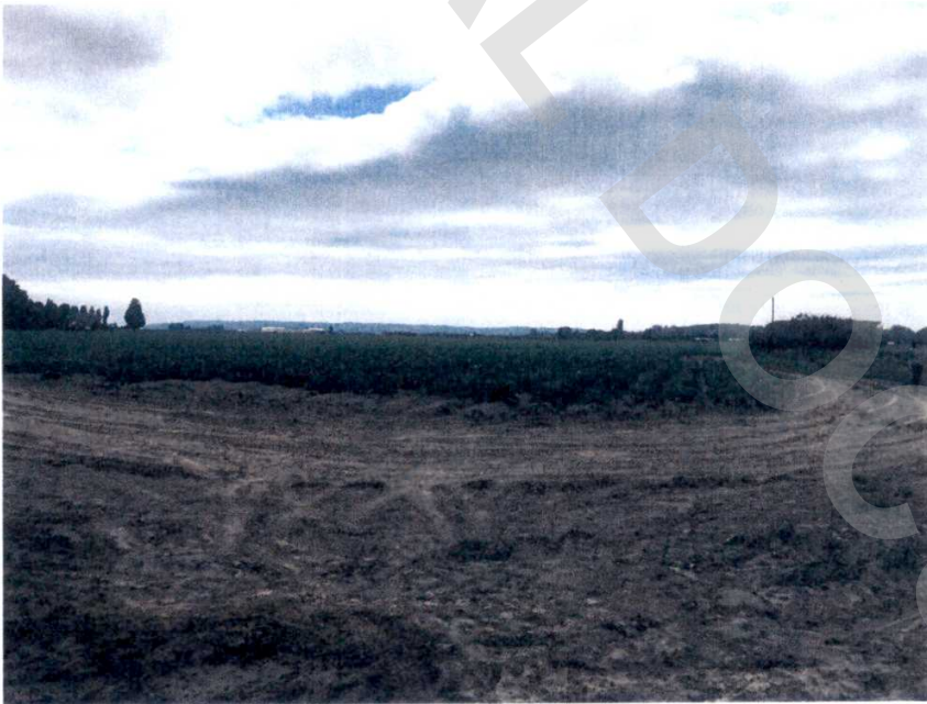
Photo 8- view west from location E