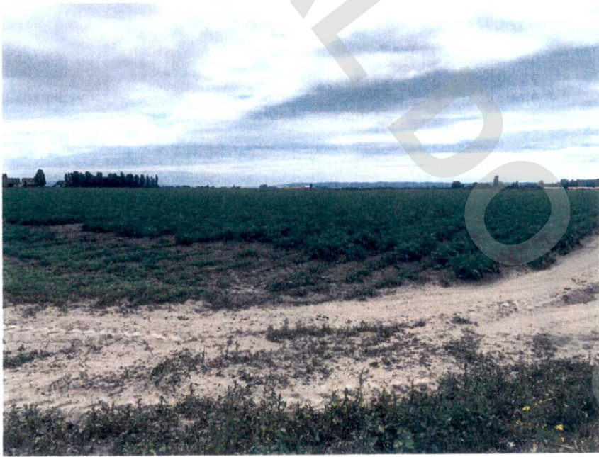
Photo 2- view west/southwest from location A