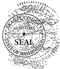
EXHIBIT B 2