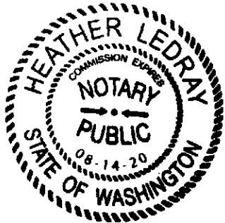
(Seal or stamp)