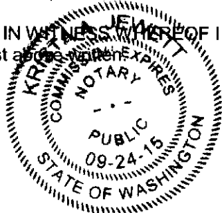
Notary Public in and for the State of Washington, Residing at: Mount Vernon

IN WITNESS WHEREOF I have hereunto set my hand and affixed my official seal the day and year first above written.