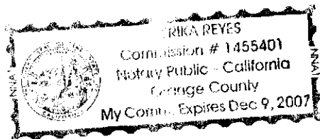
Signature of Notary Public