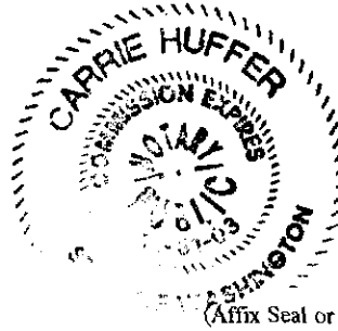
(Affix Seal or Stamp)