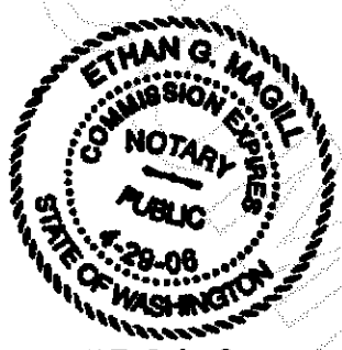
(Affix Seal or Stamp)