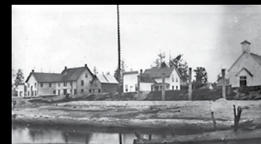
Skagit City, 1870