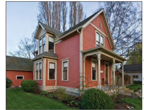
4 Mary Davis Baptist Parsonage (1880s) 113 S. Whatcom St., La Conner