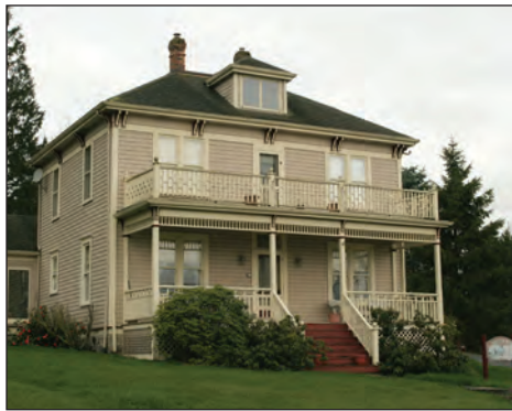
1 Bethsaida Swedish Evangelical Lutheran Church Parsonage (1894) 17549 Valentine Rd., Mount Vernon

Originally used in conjunction with the Swedish Lutheran Church on the same property, this fine house actually once served as a potato storage facility and, after renovation, as a B&B.