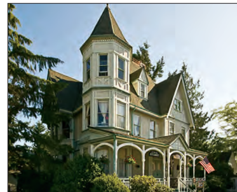
7 Gaches Mansion / La Conner Quilt & Textile Museum (1891) 703 S. 2nd St., La Conner

This fine old structure evolved from a grange hall into a federal and county courthouse, lodge hall, school, library, Episcopal church, and well-loved community hall.