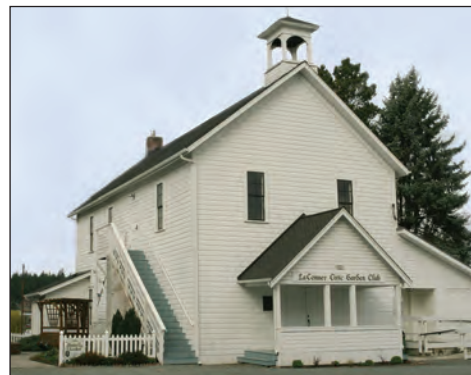
6 Town of La Conner La Conner Civic Garden Club (1875) 622 S. 2nd St., La Conner Refreshments served ☕ 🍷